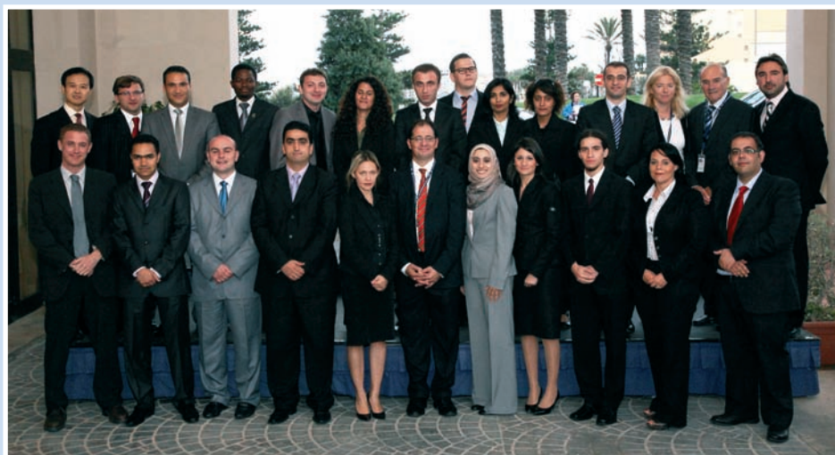
Above: Master Class 2010 - 2011 with academic staff at MEDAC.

The highlight of this 10-day programme was the consultation we had with his Excellency President Paul Kagame on the 15th of September 2010, during which I had the honour of presenting him with a copy of my Masters Degree dissertation. He urged us youths to learn from the Rwandan experience and to act as agents of peace.