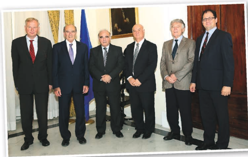
The Chairman and Members of the MEDAC Board with the Minister of Foreign Affairs, the Hon. Dr. George Vella.

Global foreign policy initiatives towards the Mediterranean and economic assistance programmes intended to encourage and assist democratization processes require an understanding of the specific conditions of each country in transition if they are to be successful. Surprisingly, mapping out such a comprehensive strategic agenda towards the Mediterranean since the revolutions of 2011 remains a non-starter. Strategic thinking on its own will not make a difference on the ground. Decisive results will only be achieved when rhetoric is matched by resources geared towards sustainable development projects in all of the countries in transition.