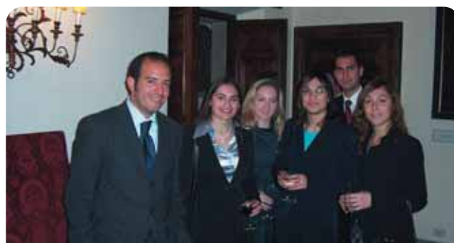
MEDAC Class 2005/06 during the study-visit to Rome.

crucial in promoting the further enhancement of an already existing diplomatic network – a mechanism which I have the pleasure of tapping every once and again and which makes matters easier in the course of one's duties in the diplomatic sphere.