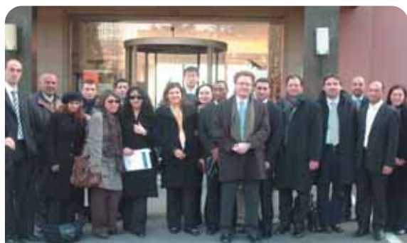
MEDAC staff and students in front of the Graduate Institute of International and Development Studies (HEI), Geneva.

Perhaps more than ever, the Mediterranean faces pressing challenges, including unresolved conflicts, concerns over human rights and development, climate change and migration. Thanks to the steadfast support of MEDAC's creators and of other partners who have joined more recently, we believe that MEDAC will play an ever more important role in building bridges between Europe, the African continent and the Middle East. MEDAC looks forward to continue providing a platform for open and constructive dialogue on the most important challenges in the region.