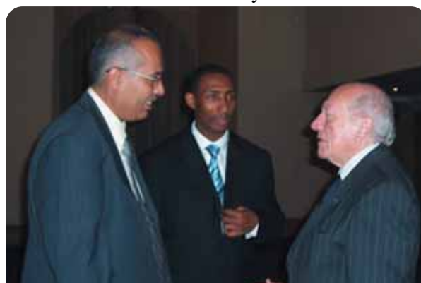
M.Dip Students greeting Prof. Guido de Marco, Chairman of MEDAC at the Opening Ceremony.

never forget about this experience – the University itself, the Academy, my class mates and the people in Malta. Thanks to all of you who helped me have such a great and fruitful experience in this wonderful country!