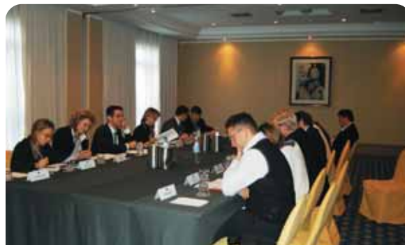
Participants during the Simulation Exercise.

Specific attention was dedicated to topics that include: The Euro-Med Partnership and the French EU Presidency,