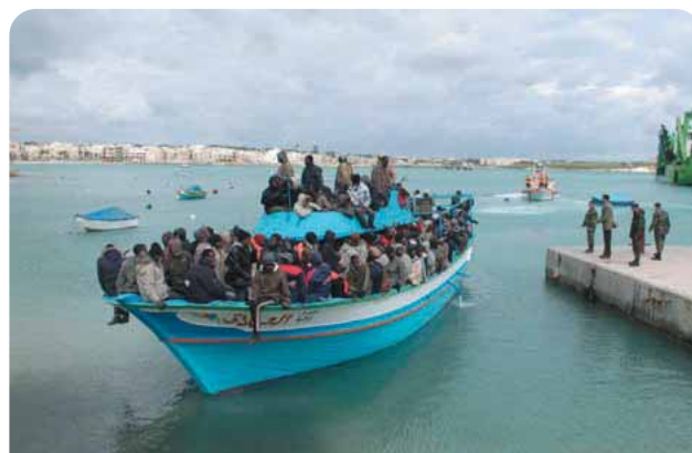
A boat with immigrants from Africa landing in Malta.

and challenges in the Mediterranean region. It is open to both policy-makers and academics, and in particular seeks to give a stronger voice to southern Mediterranean countries in areas related to migration and development in the region. A further objective of the Forum is to publish high-quality and policy-relevant studies on migration issues in the Mediterranean region. The first workshop of the Forum was held in Malta in June 2008.