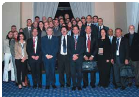
Euro-Med Seminar Group Photo with the Hon. Dr. Tonio Borg, Deputy Prime Minister and Minister for Foreign Affairs, Malta.

Further information on the Euro-Mediterranean Seminars can be found at www.euromed-seminars.org.mt