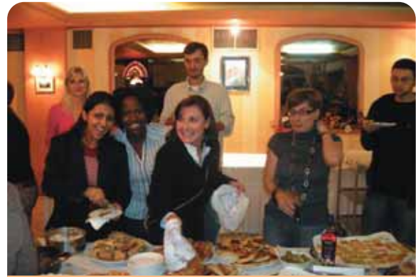
Students laying out their traditional food.

This event is not only a social gathering, but also introduces the students to the big MEDAC family. Despite living in different countries, we all share a common experience which hopefully we will all cherish and remember with nostalgia.