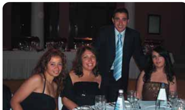
M.Dip Students 2007/08 during the Farewell Dinner.

Bringing together young and aspiring diplomats from all over the world surely fosters and deepens ties between them proving to be by far the richest experience of all.