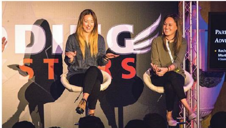
This year's edition of Budding Rockstars.

The 2017 edition of Budding Rockstars was held on November 16 at the Hilton Malta Hotel, St Julian's. The event was attended by 150 Form 5 students and more than 50 educators from 40 Schools in Malta and Gozo.