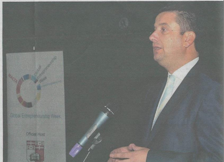
Edward Zammit Lewis

Dr Zammit Lewis congratulated the college and the Edward de Bono Institute for their hard work.