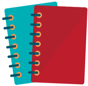
Books Dictionaries Notes