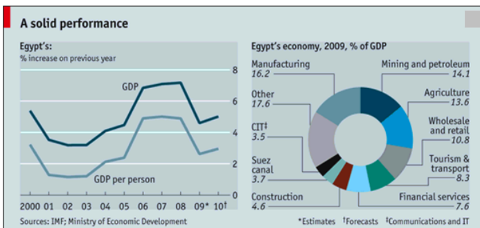
Figure 4.1: Performance of the Egyptian Economy Prior to the 25 th of January Revolution.

Prior to the revolution on the 25 th of January, the economy in Egypt as a whole was performing better than ever. GDP growth had shifted into a much higher gear, increasing from just below 5% in the mid-1990s to 7% in 2006-08. Egypt's share of world trade, which had been falling continuously for 40 years, started expanding as exports tripled in value. Foreign investment gushed in at record levels, notching up a cumulative total of $46 billion between 2004 and 2009. Gross public debt in that period fell by nearly a third. The size of the country's foreign debt dropped below the value of its foreign reserves for the first time in decades, and debt servicing, a crushing burden in 1990, dwindled to a small fraction of the value of annual exports.