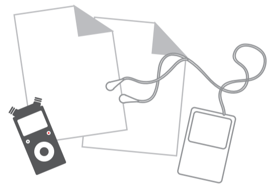
Blank paper Recording material MP3/MP4 players