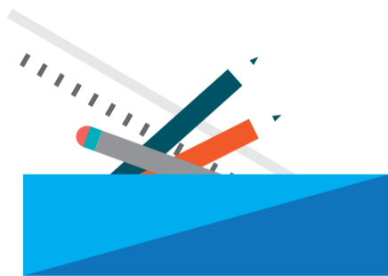
Pencil case (on desk)