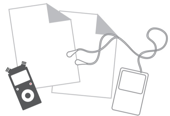
Blank paper Recording material MP3/MP4 players