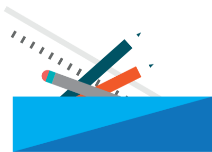
Pencil case (on desk)