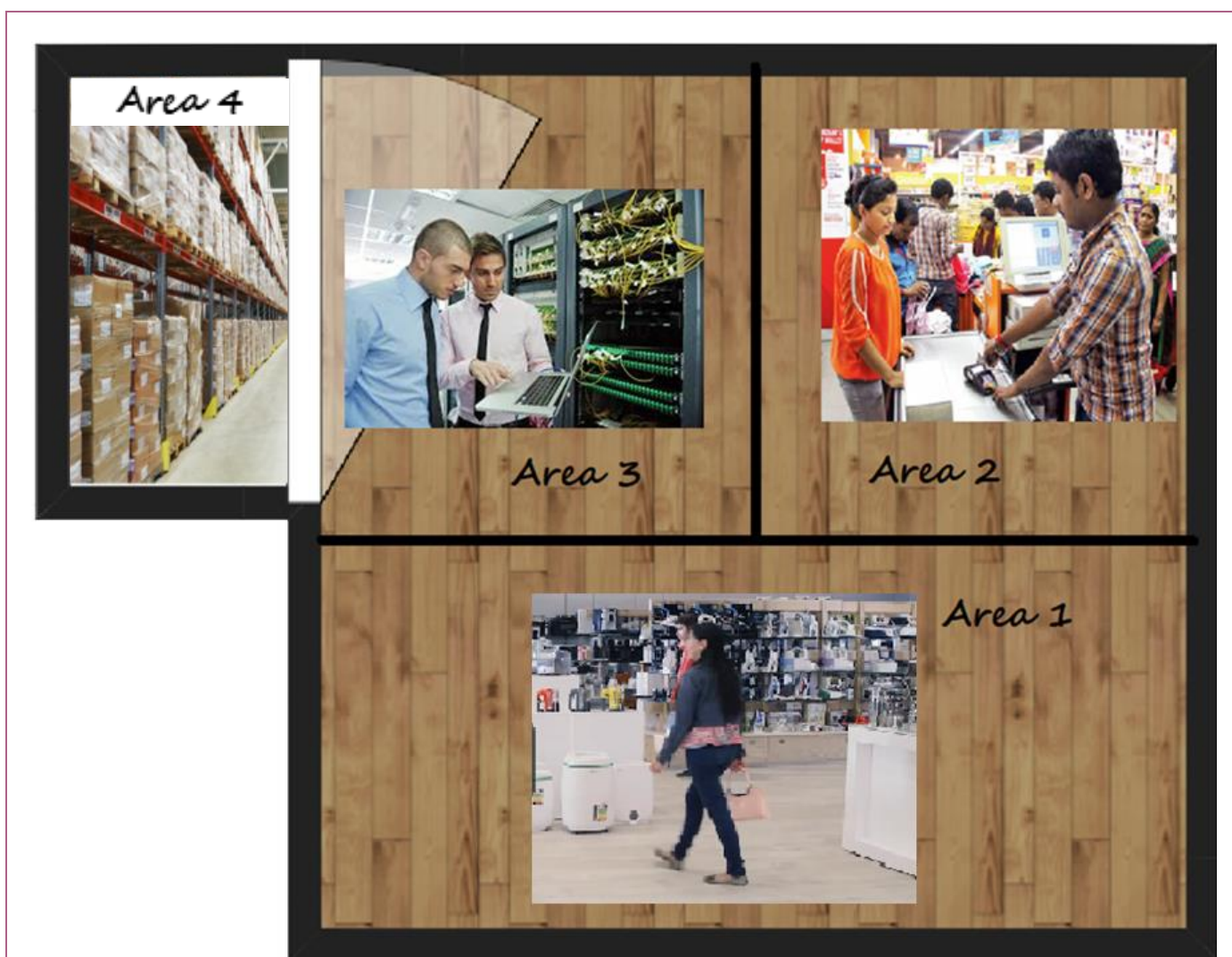
Figure 1 - Floor Plan