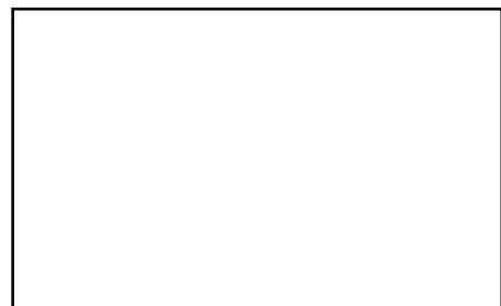
School Rubber Stamp (If Applicable)