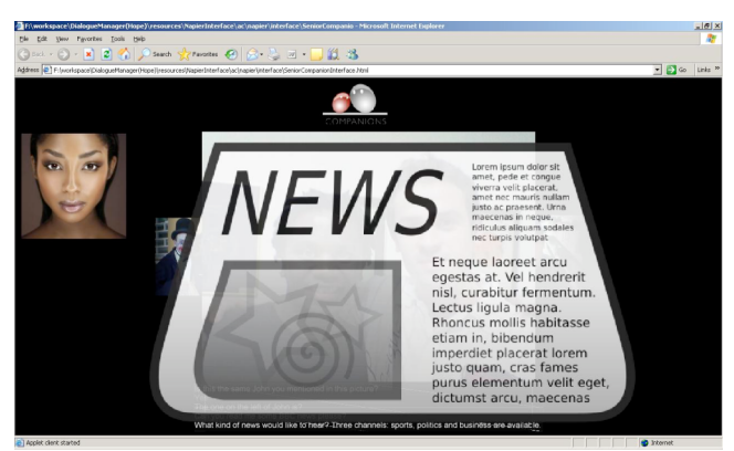
Figure 1c: Senior Companion news reading screenshot

The Senior Companion is a multimodal dialogue system for discussing information about the users life in a natural way through photographs. Although we are aiming to discuss a broader range of topics later in the project, to begin we have identified a basic selection of topics that will allow the system to engage in a lively dialogue and establish a platform for reasoning about user information. The initial topics we have selected for engaging in a dialogue about a user's photographs are: the location of photograph, when the photo was taken and for what occasion and the names and ages of the people in the photos as well as their relationship to the user and to each other. Not surprisingly, the key information for each of the topics mentioned includes Named Entities: Person Names, Locations, Dates/Times, People Relationships, etc. Based on this, we have chosen an Information Extraction approach to recognize and extract such information from the user's utterance which is explained in more detail in the following sections of this paper. Figure 2 contains a very simple user session taken from an early version of the demonstrator.