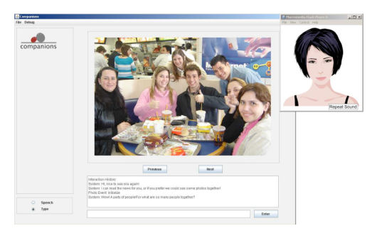
Figure 1a: Senior Companion screenshot version 1

The construction of an enjoyable and cohesive interaction between the user and the computer in the Senior Companion sets the scene for advanced multimodal dialogue research and in particular the research discussed in this paper.