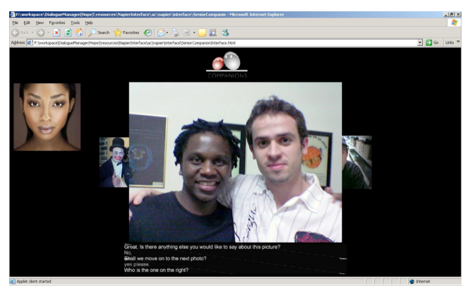
Figure 1b: Senior Companion screenshot version 2