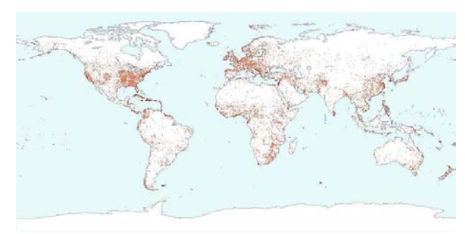
Figure 2. System Output for 1 January 2000.

amount of news coverage likely to occur at any particular location in the world.