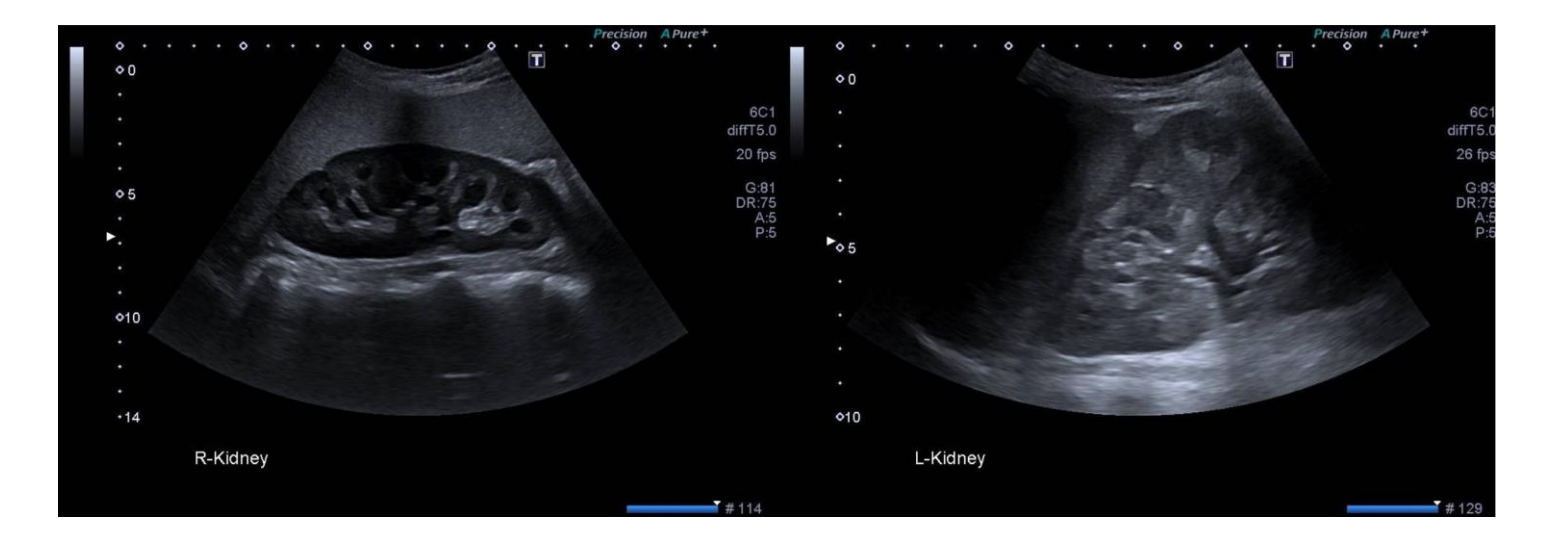
Figure 1 Ultrasound images of both kidneys showing hyperechogenicity of the renal medullae indicative of medullary nephrocalcinosis