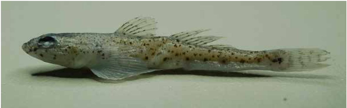
Fig. 1. Pomatoschistus marmoratus . Male, 28.1 + 5.4 mm, PMR VP5349, Malta, Ghadira Bay, preserved specimen, slight remnant of bluish staining still visible, photo by M. Kovačić.