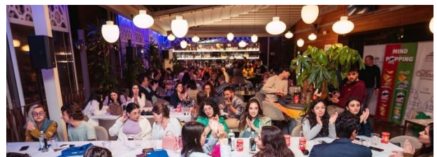
The Quiz Night in full swing