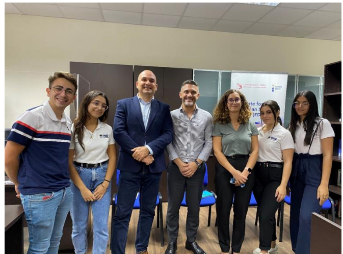
The speakers with members from ESO