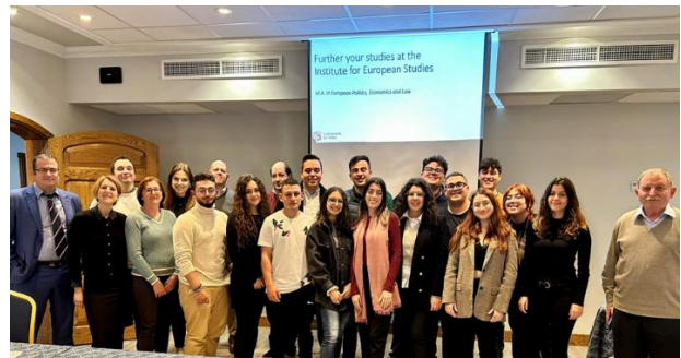
Photo of students and staff at the Theses Workshop

The Undergraduate Dissertation Workshop was held on 21 February 2023 at the Paradise Bay Hotel in Cirkewwa. Sixteen final year (Honours) students on the undergraduate course presented their ongoing research to their fellow students and the Institute’s academic staff with the latter providing feedback. The Workshop went well and student feedback was very positive. A full list of the dissertation titles can be found at the back of this newsletter.