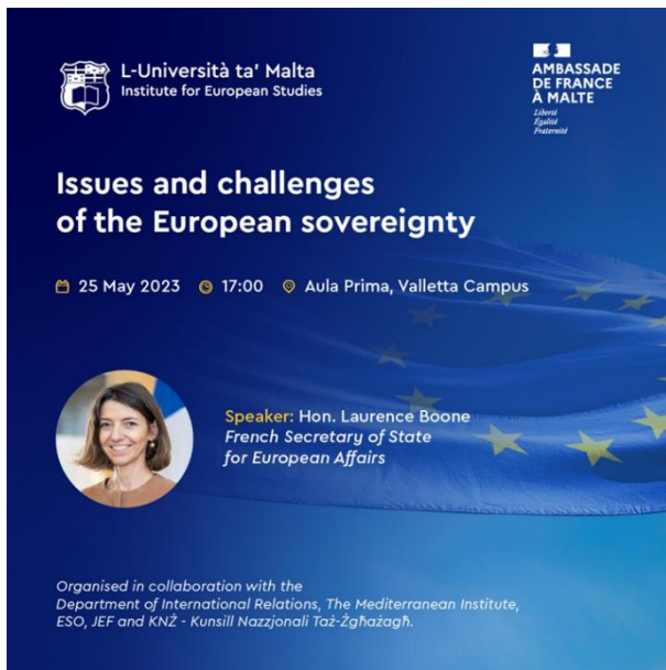
Poster of the event