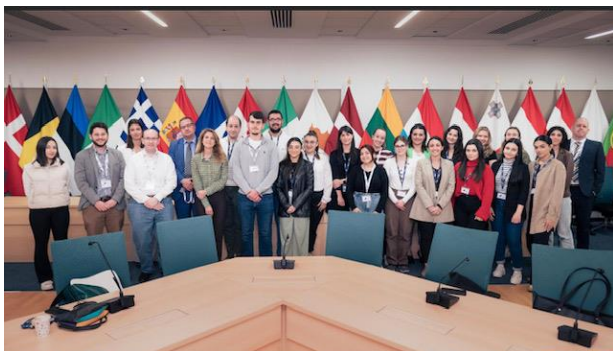
Group photo of Institute students and EUAA staff