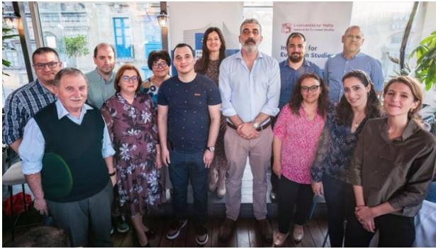
Institute staff with members of the European Commission's Representation to Malta