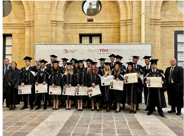
Photo of 2023 Graduates, Masters in European Politics, Economics and Law

In March 2023 graduation was held for the MA students who completed their degree in 2022.