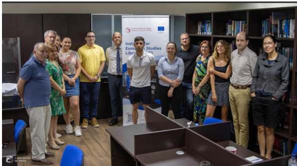
Photo of students and staff at the Theses Workshop