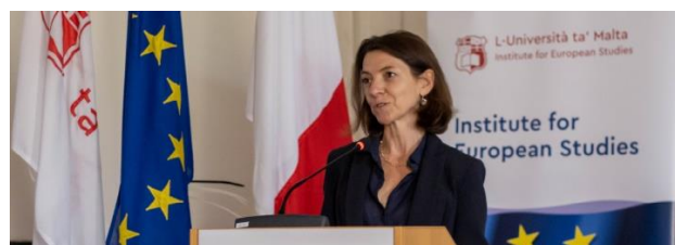
Minister Boone addressing the event