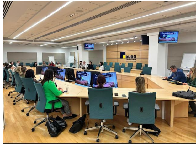
Presentation by EUAA staff