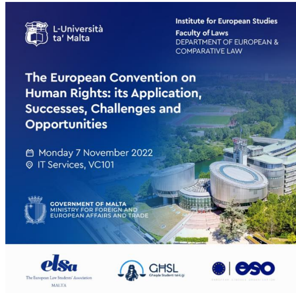
The poster of the event

The Panel Discussion was organised as a means to enhance the visibility of the Council of Europe in preparation of Malta's forthcoming Presidency of the Committee of Ministers in 2025 and to reflect on Malta's human rights protection since its ratification of the Convention in 1967.