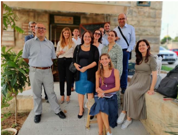
Photo of the event