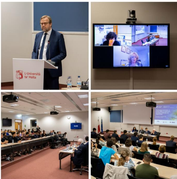
Photos from the event

In January 2023 the Institute participated in the Junior College Careers Expo, held between 16 - 20 January 2023. The aim of this activity was to give a first-hand opportunity to students to discover and start exploring different study routes and career paths.