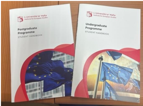
The new Student Handbooks

Institute's sought to provide students with information which will help them navigate the course better such as basic information on assessments, grading and classification as well as generic information on the University's support services. In 2023 this was complemented by a handbook for the postgraduate, taught course. Both handbooks were created in close collaboration with the University's Communication team and the Institute would like to extend its thanks for their sterling work.