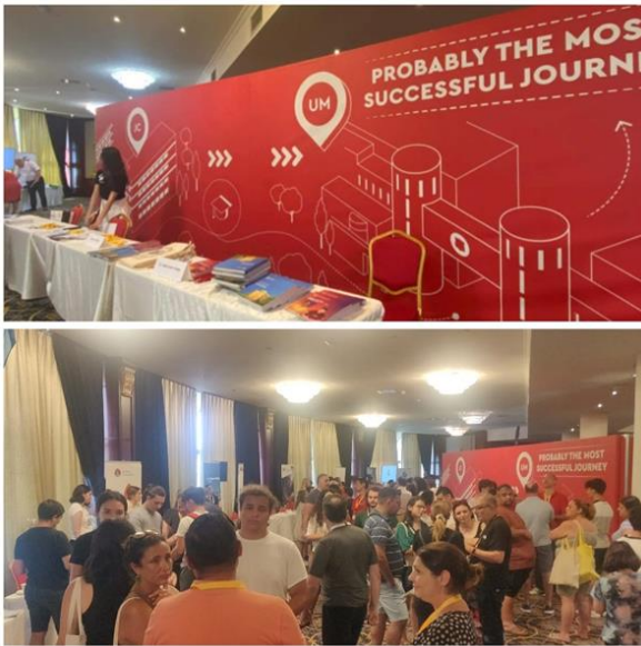
Photos of the event

which offers an opportunity whereby students can explore further career and educational options as they leave compulsory education.