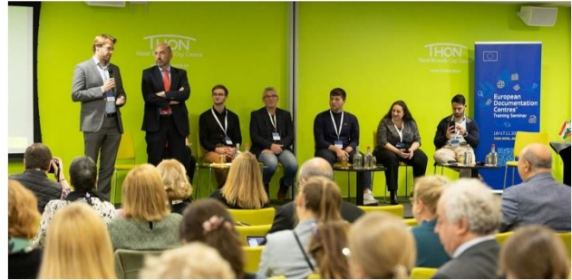
Photo of the event