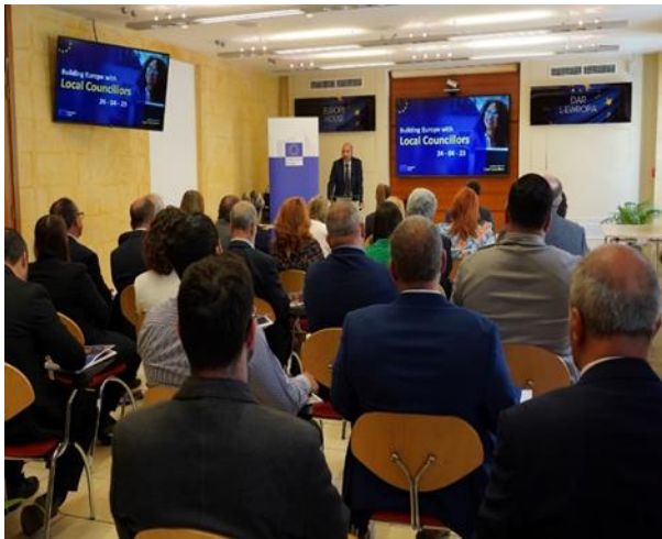
Photo of the event

Europe Direct Valletta (SEM - Servizzi Ewropej f'Malta), EUROPE DIRECT CORE Platform and Europe Direct Gozo, as well as the European Documentation Centre (Institute for European Studies - University of Malta) introduced their respective entities with a view to forging future collaboration with Local Council representatives within their catchment areas. The project is organised in close cooperation with the Committee of the Regions' European Network of Regional and Local Councillors.