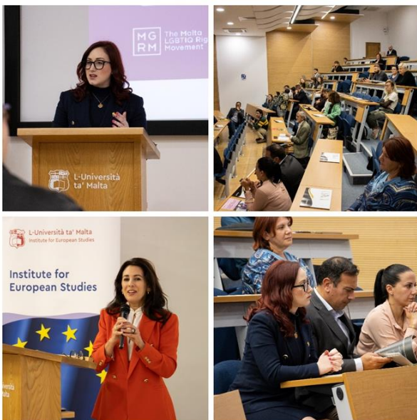
Photos from the event