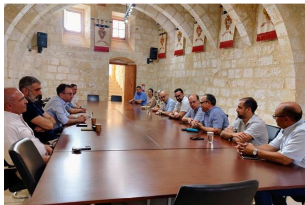
Photo of the event