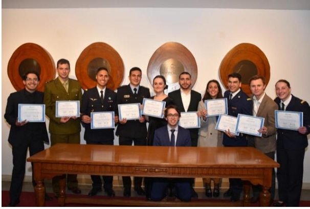
Participants of the event