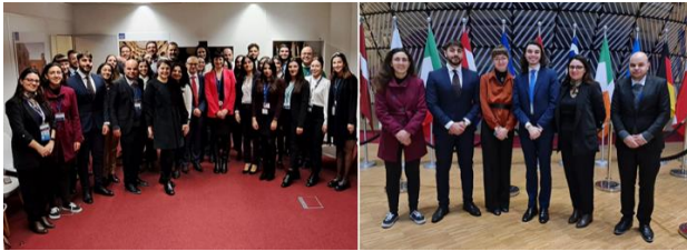
Students participating in the simulation as well as their visit to Malta House

Studies assisted the team of students as a national coordinator.