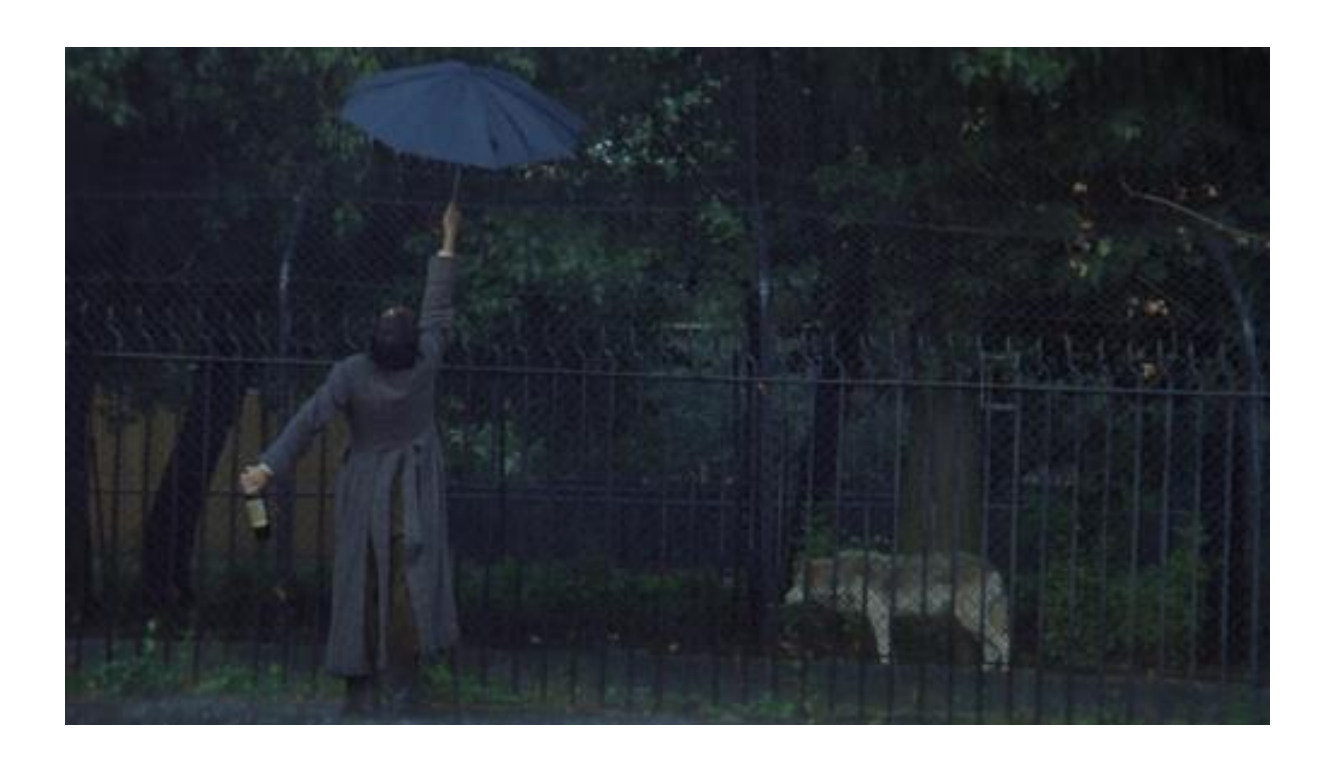
Figure 1: Withnail quoting Hamlet in Withnail and I (1987).

Before we read Hamlet , we know what it is about. Centuries of performance and critical debate surrounding the enigmatic play, often described as an artistic mess on the one hand and the definitive masterpiece of English literature on the other, have fossilised Hamlet in our collective memory. We are familiar with the philosophical questions before we read them in verse. The image of a man pondering death while holding a skull is with us before we learn to trace it back to Hamlet . It is synonymous with the best that great literature stands for, and more. William E. Gruber calls it 'the central drama of our culture', with a language that 'shapes our idiom' and 'governs the way we think on certain critical matters'. He summarises the cultural impact of Hamlet as 'a belief that the play comes closer than any other to capturing the mystery of human destiny'. For David Bevington,