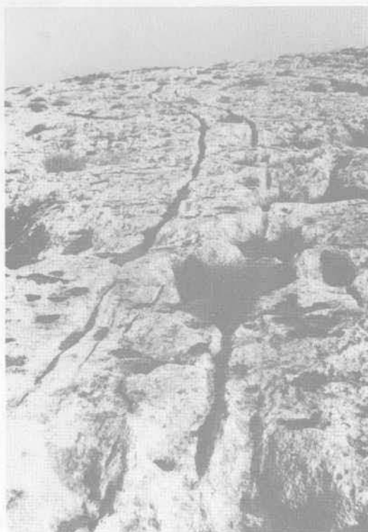
Plate III: Track 4 looking towards the northeast. The rut on the right passes through a series of deep pits.