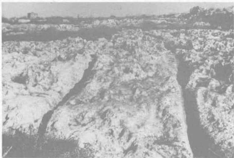
Plate VI: Very rough terrain at the west end of Track 6.