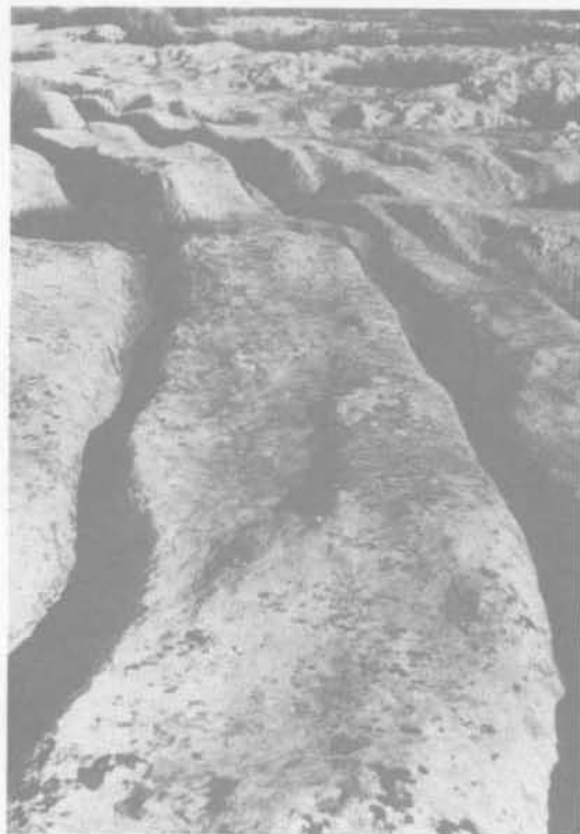
Plate VII: Detail of Track 1B that captures evidence of the severe pitch and roll to which the vehicle using this track must have been subjected.