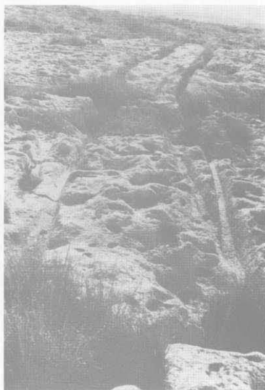
Plate 1: Track 1 looking towards the southwest.

The first branch appears at about 65 metres from the west end of Track 6 and is marked 6A on the map. This track can be easily followed for the first 70 metres and beyond that traces of it are found over a further distance of 30 metres. In addition, there is a short track which branches out of Track 6A and runs parallel to it for a short distance. The average gauge of the main track is 143 cm with a range of between 138 and 148 cm.