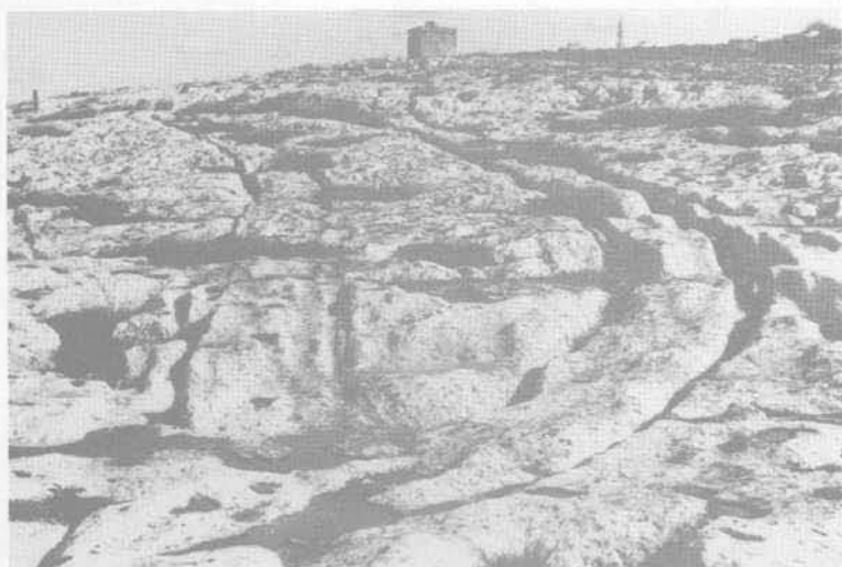
Plate II: Track 1B, on the right, crosses Track 3, left of centre.