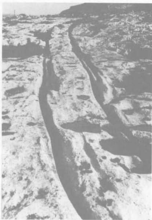
Plate V: Junction of Track 1B, on the left, and Track 3.