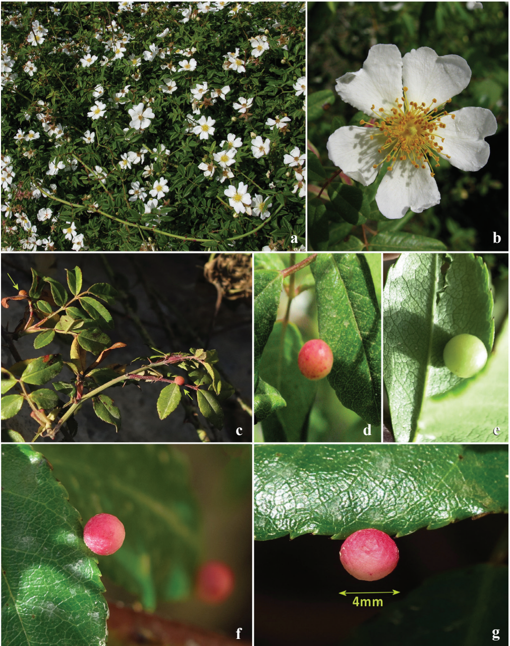
Figure 1 a–g: Rosa sempervirens ; a–b: Inflorescences and detail of flower; c: Galls from Wied Anglu (May, 2016); d: Gall from Wied Incita (May, 2008); e: Gall from Wied il-Kbir (May, 2016); f–g: Gall from Wied l-Isperanza (May, 2016).