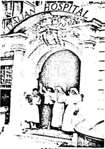
Figure 3. A goodbye from the Italian Hospital. Image from the 1961 Italian Hospital Annual Report.

With the assimilation of the Italian community and the use made of the NHS, the needs for which the Hospital was founded have gradually faded. Moreover, had the Hospital to survive, the advances in medical science would require a substantial injection of new capital. The Trustees have considered various schemes of obtaining new capital but none of them would enable the Hospital to remain both financially viable and maintain its charitable objectives. 83