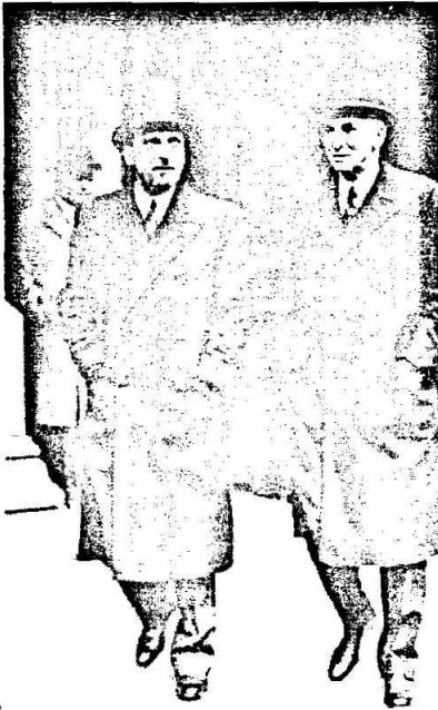
Figure 2. Italian Ambassador Dino Grandi and Foreign Secretary John Simon in 1932.

of Mussolini, who sent him to London in order to upgrade relations with the UK, but also to keep him at a distance.