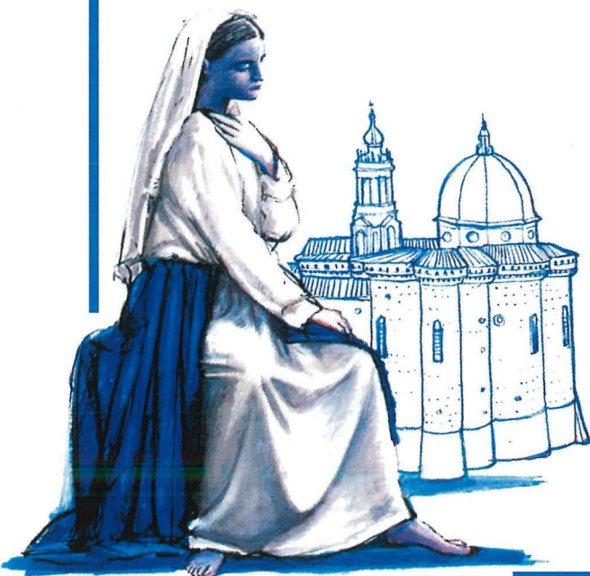
Painting by Amadeo Brogli, Loreto Sanctuary, Italy