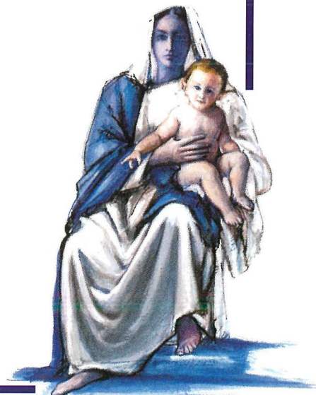
Painting by Amadeo Brogli, Loreto Sanctuary, Italy