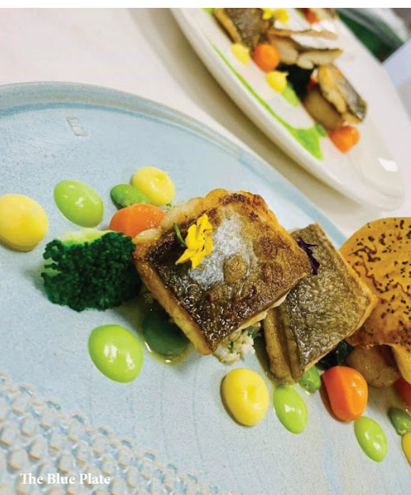
The Blue Plate

The potter/ceramist suggested that I provide the designs for the plates to be commissioned, and eventually my designs were artistically transformed into two ceramic bowls and one ceramic plate.