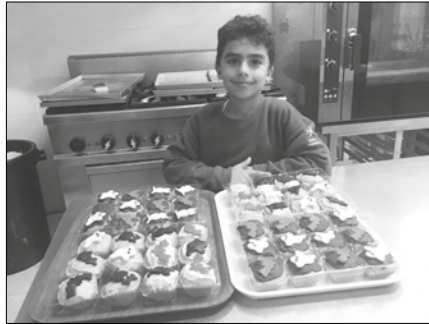
Fancy some cupcakes?