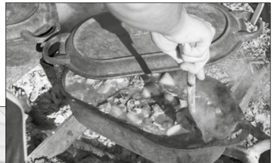
Nothing beats our campfire stew.