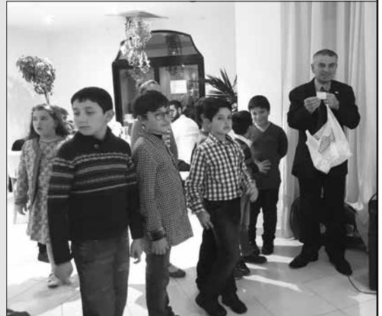
Cubs are eager to help during the raffle.

Thank you to all those who gave a helping hand in one way or another during the whole (lengthy) process of these cake making sessions. - shopping, weighing, mixing, baking, washing up, decorating and finally packing, labelling and delivering these cakes.