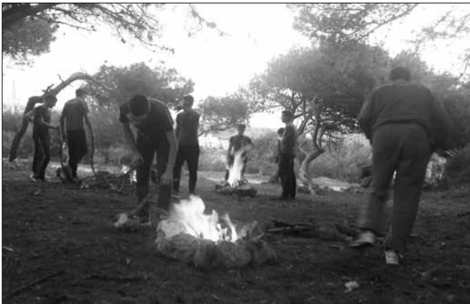
November cook out

November was a very active month for the Unit with the majority of the activities being held outdoors. A Night Game in the newly refurbished Citadel, with games including Capture the Flag and Hide and Seek, as well as the Annual Local Area Network Party (LAN party) kicked off the month. Both activities were a success, creating a number of unforgettable memories, amongst others, the creation of the Burger Pie during the LAN party itself. Both activities contributed greatly towards improving the already strong bond and teamwork within the Unit. The following day the Unit also attended the activity mass which was held for all the group.