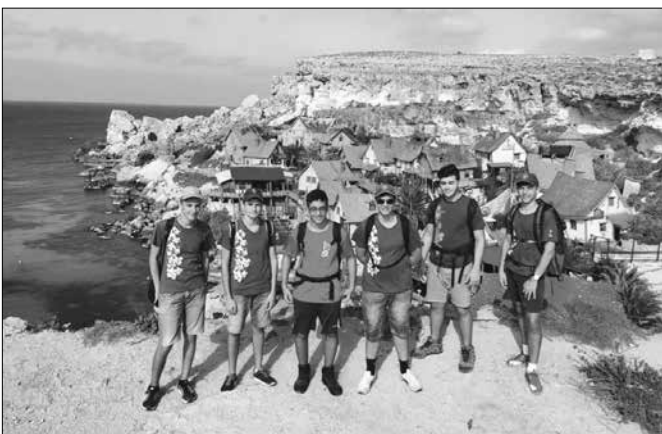
Ċirkewwa to il-Buskett expedition