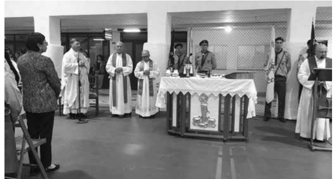
Mass at the Seminary gym