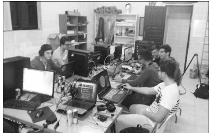
Unit Computer Squad during the LAN party