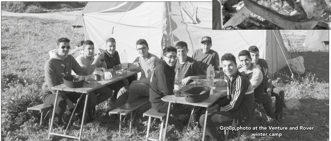
Group photo at the Venture and Rover winter camp