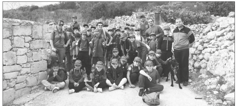
During the Pack hike