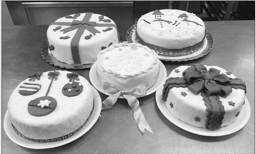
This year's decorated cakes