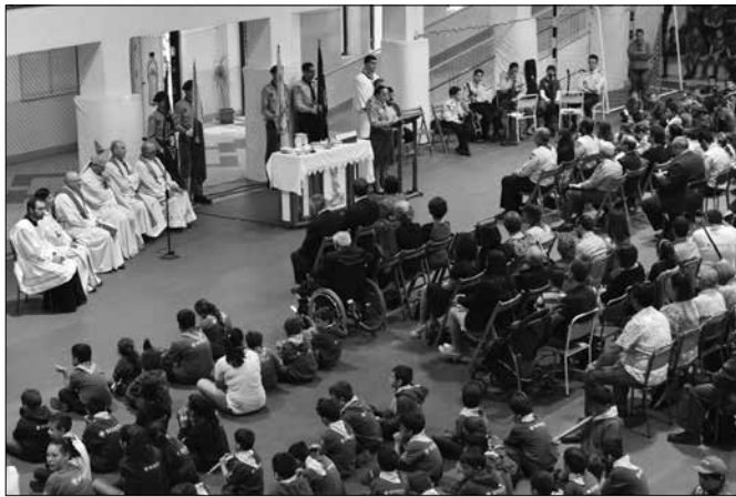
Mass at the Seminary gym