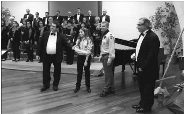
A well-deserved applause for all