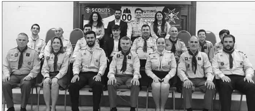
Group photo of some Scouters from the Victoria and the Xaghra Scout Groups