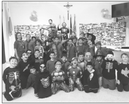
At the sleepover

During one of the meetings in November, the Cubs commemorated World Diabetes Day. By means of a Powerpoint presentation and a discussion, the leaders highlighted the importance of a healthy diet and the need to exercise. The symptoms of this