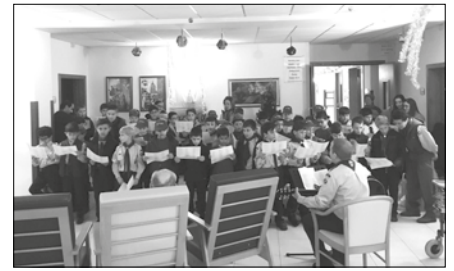
The Packs perform their good deed.

At the beginning of December, as their good turn for the Christmas period, the Packs visited a home for the elderly. They entertained