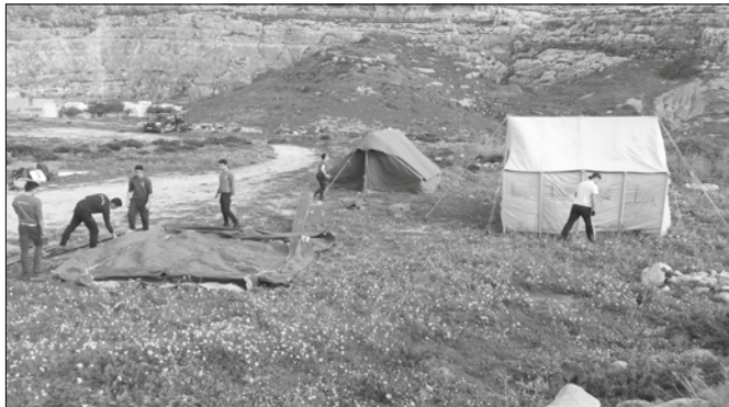
Setting up camp

Let's keep coming up with such activities to live the Scouting Spirit to the full!