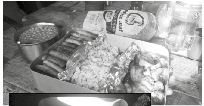
Breakfast – before and after.

The main focus of the camp was "Camping skills" with activities varying from setting up a campsite, pitching and striking tents, building a fire and cooking.