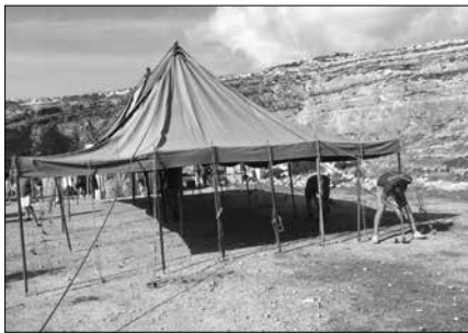
The marquee lunch at Dwejra