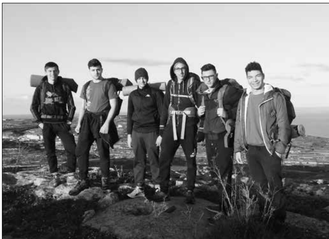
The Ta' Ġordan expedition

December marks the Christmas period which immediately brings to mind the Christmas school holidays. Once again, a hike was organized by the Unit: a night spent in a room near the Ta' Ġordan Lighthouse. The Unit braved through the thunderstorm persistent throughout the evening to complete the hike and dined at their final destination. Other meetings so far include the assembly of Christmas decorations throughout the HQ, as well as the planning and preparations for the Joint Rover and Venture Winter Camp which will take place from the 27 th to the 29 th of December. Activities planned include instructions, board games as well as a variety of wide and night games.