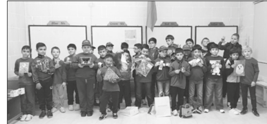
The Cubs and their Christmas decorations

the residents with some Christmas carols and some Scout songs. Before leaving, the boys distributed some gifts.