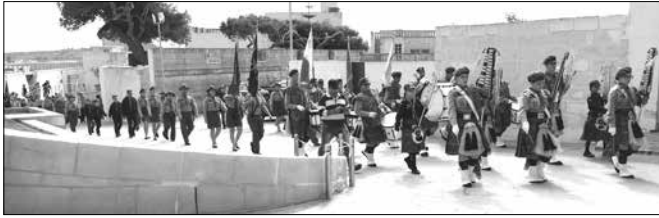
One of the bands approaches the Citadel Square.