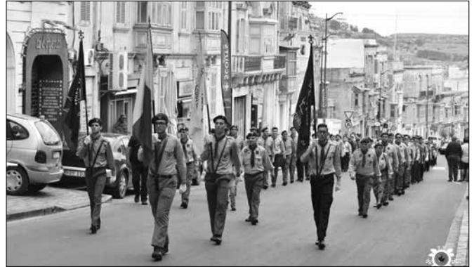
The Group marches along Republic Street.