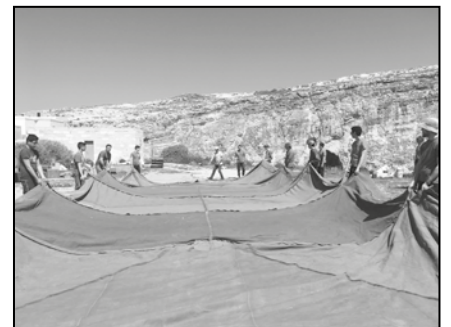
All hands on board. Let's put the marquee tent up boys.