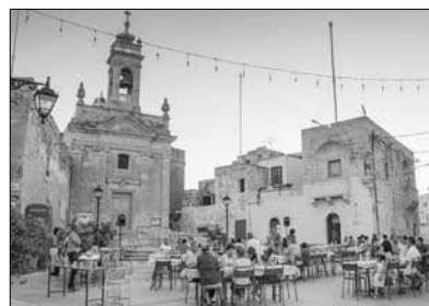
A view of the square at Santa Lučija