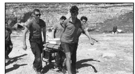
The big boys get to do the heavy stuff.