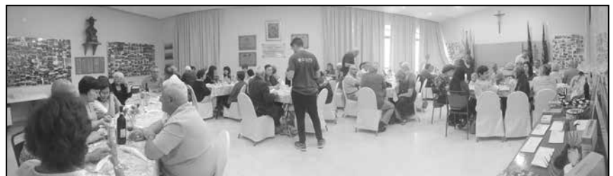
The Friends of the Sick and Elderly lunch

On Friday 26 th May, a pasta and pizza night was held at headquarters. Every summer, members of the group Volontariat f' Bari spend some weeks in Bari, Italy helping out in a convent run by the Sisters of Mother Teresa. These nuns work with disadvantaged youths and children. In this way, the Gozitan and Maltese volunteers, together with some Group Council members and leaders, raised funds for their stay in Italy.