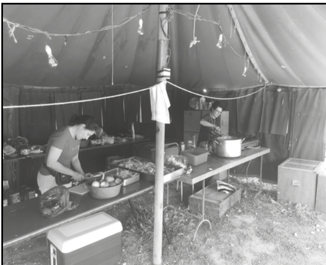
Preparing for the hungry hordes