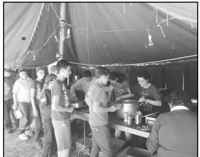
Here they come