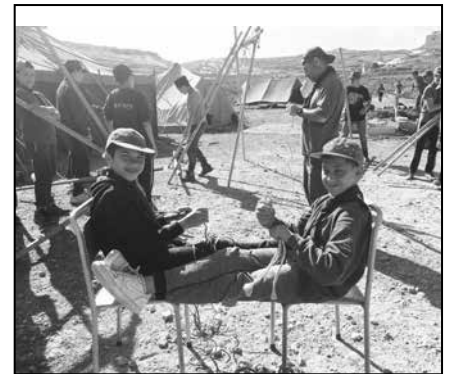
Dismantling the towers. Do you remember these knots?