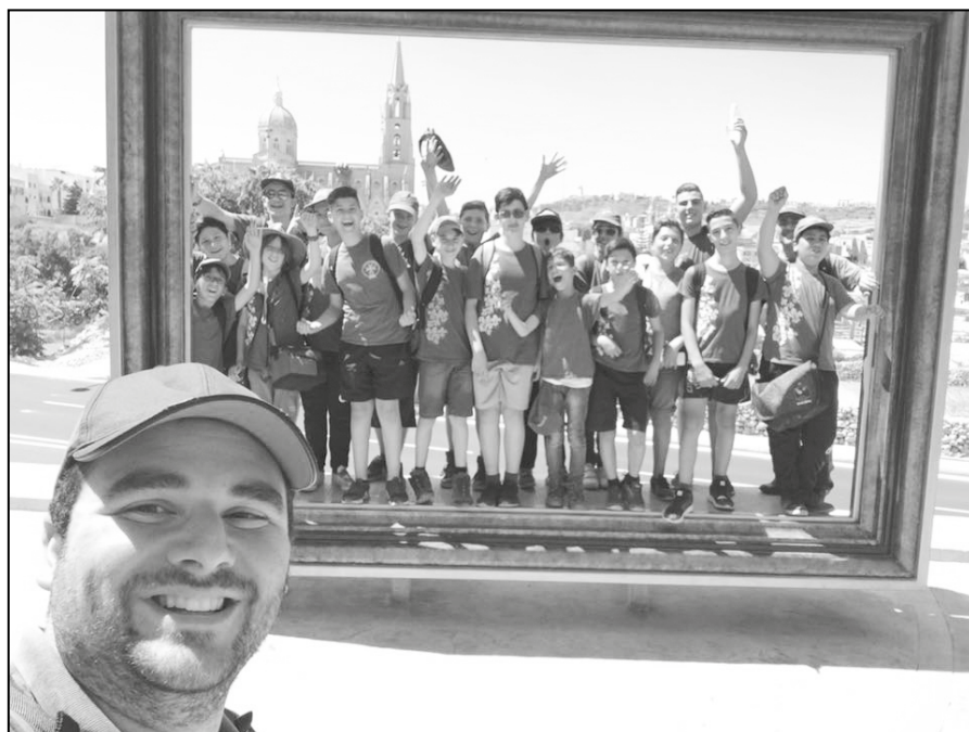
The Troop's hike is framed for eternity.

This phrase is often used to describe the stereotype Scout - that small Scout that is helping an old lady to cross the road. While this may not be an ideal representation, it does make one thing absolutely clear. When someone mentions Scouts, one of the first images that pops up is someone who is helping others. In the Cub Law we find something similar - Do a good deed every day. What does this mean however? If I already did my good deed for the day, can I stop? Or if I do another one, does that count for tomorrow? And what happens when I don't do one today? These questions used to trouble me as a Cub (many, many years ago). Today I realise that this promise already has the answer, DO YOUR BEST . How can I help others? Help may come in different versions. It can be material help but it can also be an emotional one. Sometimes you do not even realize that your words or your actions are helping others. Back when I was of Scout age, I was being bullied at school. It was thanks to the words and actions of kids that were Scouts that I was able to move forward. Today, whenever I hear a