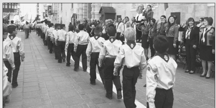
The Group salutes the President of Malta and the Chief Scout and Guide.

The Group took part in this year's annual Scout and Guide rally. The Group marched from Island Headquarters in Floriana to Valletta. On passing in front of the Grandmaster's Palace, they saluted the President of Malta, Marie Louise Coleiro Preca and the highest authorities of the Scout and Girl Guide Associations.