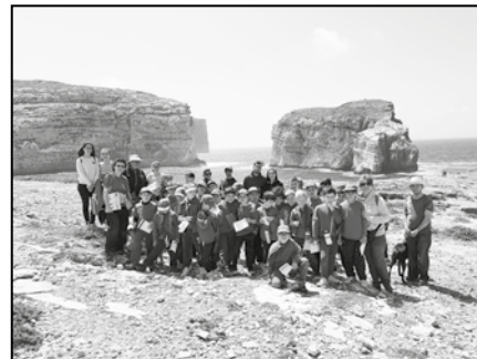
A nature hike around Dwejra as part of the World Scout Environment Badge