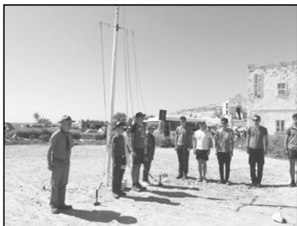
Flag down. Another camp is over. Till we meet again.