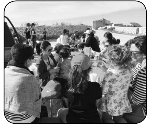
The hikers stop for a coffee break.

On Monday 1 st May, a public holiday, the Group organised a walk for its members, their families and friends. The group started this walk from the square in front of the primary school in Kerčem. Along their way, through the countryside and over the cliffs, they enjoyed magnificent views of the area. At the end, tea, coffee and cakes were served.