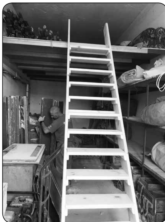
The new layout of the camping equipment stores