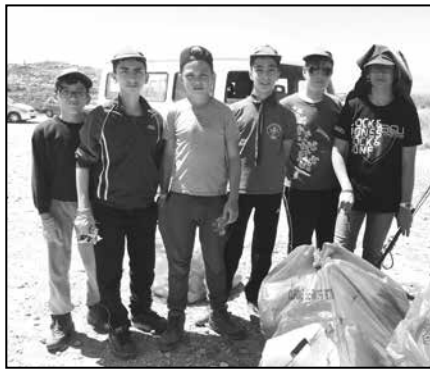
Clean-up at camp

promise that you have just made, in front of everyone, you are now not just a member of the Victoria Scout group but a FULL member of the worldwide Scout Movement." Every time I hear them I focus on the one word – FULL . Why is the GSL using these exact words? Why does he not just say a member of the worldwide Scout movement? However when reading the Scout Promise again, one realizes that it is there to be followed in FULL not in part, or in those parts that are easier or sound better. I have to be a FULL member because in the end that is what I said – ON MY HONOUR I PROMISE .