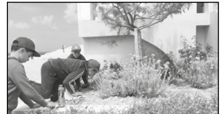
Getting up close to Mother Nature. It is true. The Gozo Everlasting (Sempreviva t'Ghawdex) really does smell of curry.