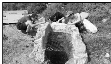
Building the smoker and putting it to the test.