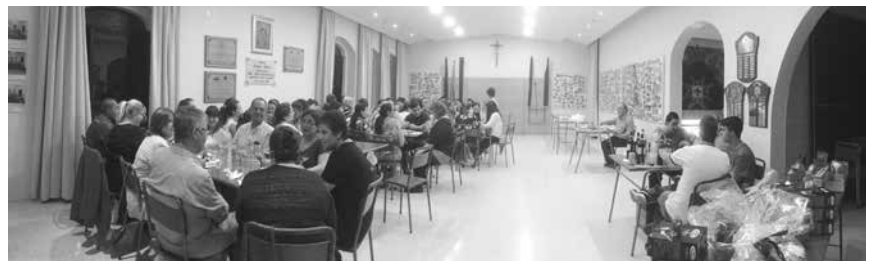
Pasta and Pizza Night in aid of the Sisters of Mother Teresa, Bari