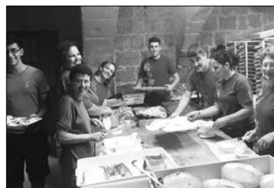
The kitchen team prepares to serve the dessert.