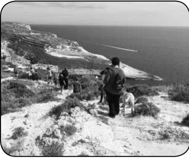
Over the cliffs and far away .....

On Monday 1 st May, a public holiday, the Group organised a walk for its members, their families and friends. The group started this walk from the square in front of the primary school in Kerčem. Along their way, through the countryside and over the cliffs, they enjoyed magnificent views of the area. At the end, tea, coffee and cakes were served.