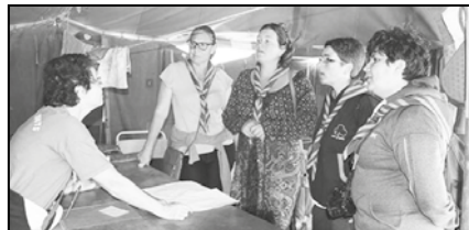
The Gozo Guides visit camp