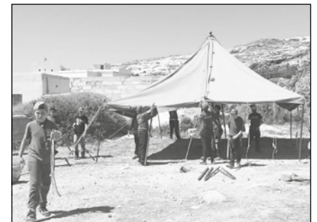
And down comes the kitchen tent after having faithfully served its purpose for the duration of camp. (and churned out meal after meal .....)