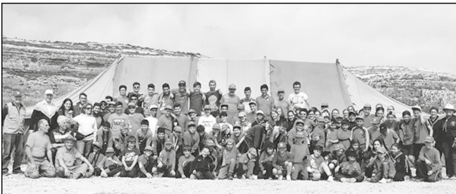
Group photo at Easter Camp 2017