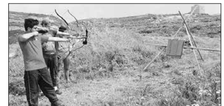
Archery time at camp