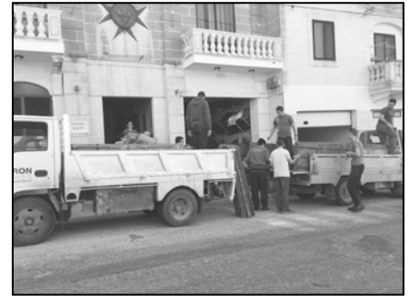
We're off to camp! Let's get all our equipment down to Dwejra.