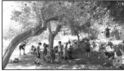
Troop hike and cookout

In life everything has its rules and laws. Every game we play is based on a few simple rules. Without rules everyone would do as he pleases and if this were to happen, then surely someone would end up not enjoying the game. In the Scout Law there are not a lot, but each of them is important in the message it is trying to portray. Most of them