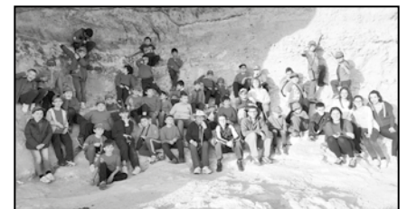
The customary visit to Baloo's Cave in the cliff face at Dwejra