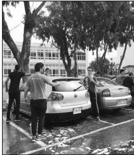
At the car wash