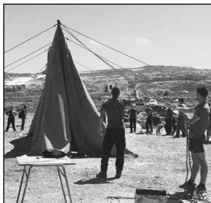
Guess if the marquee tent is going up or down