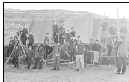
The Troop and their three towers

When we are reciting our promise, we have to understand that we are declaring it to our fellow Scouts, not to ourselves. This means that we are Promising to do our best,