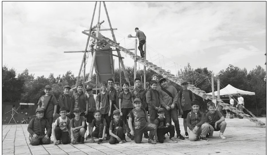
At Festa Scouts

In October, the Packs took part in the JOTI, Jamboree on the Internet. During the chatting session, they were involved in a veritable globetrotting session as they contacted over 36 countries through supervised chatting and Skype calls.