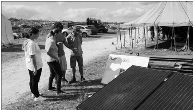
The Minister for Gozo, the Hon. Dr Justyne Caruana visits the campsite.

During this camp, the Group inaugurated a new off the grid solar PV system as part of the EcoScout project, funded through a grant by the Ministry of Gozo under the Gozo NGO scheme. The Minister for Gozo, the Hon. Justyne Caruana came down to Dwejra and viewed these solar panels. She also visited the Venture Scouts during the abseiling activity which was part of another project under the Ministry for Gozo Sports initiative scheme.