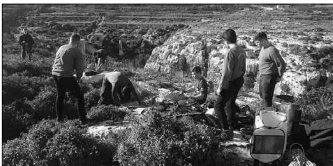
Abseiling at Mgarr ix-Xini