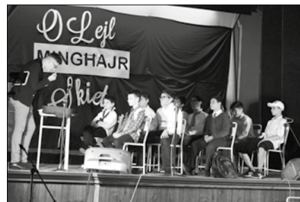
Stunts and skits by the Scout Troop