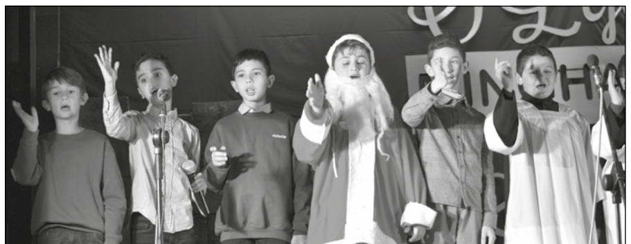
Plays and songs by the Cub Scouts