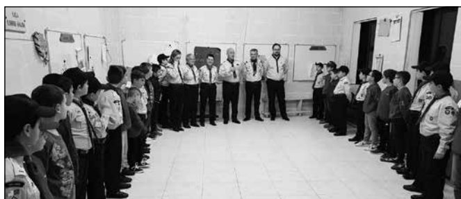
The Chief Scout meets the Scouts, Ventures and Cubs in their respective halls.