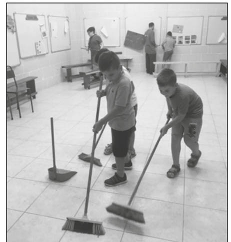
Our Cubs do take their duties seriously!