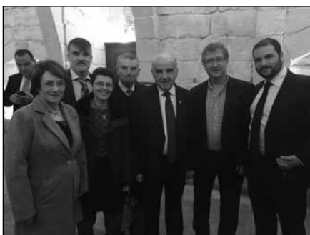
Christmas gathering - The Group Scout Leader, Group Council members and leaders meet the President of Malta, Dr George Vella.