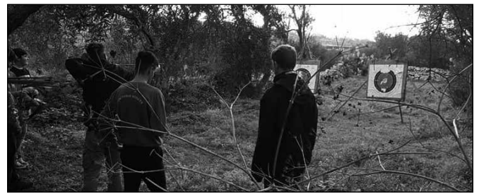
An archery session