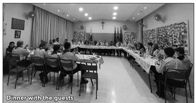
Dinner with the guests