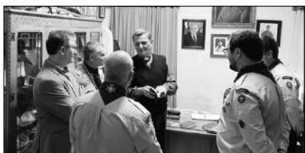
H.E. the Bishop of Gozo, the Chief Scout, the Chief Scout and the Chief Commissioner, the Group Scout Leader, the Group Council Chairman and Venture Scout Leader