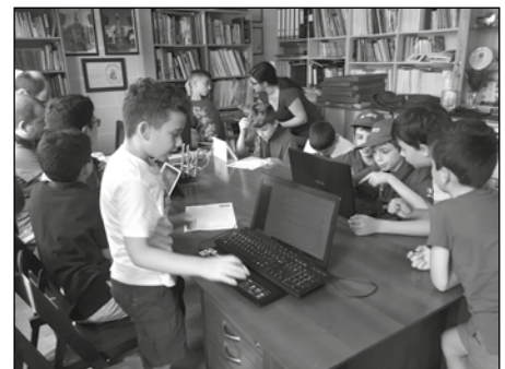
Jamboree on the Internet

In November, the Cubs took part in the Festa Scouts event held by the Scout Association of Malta at Ta' Qali Park in Malta. It was great fun and there were so many activities – climbing rope bridges, sliding down a chute, having a go at the climbing wall, taking part in a very ,