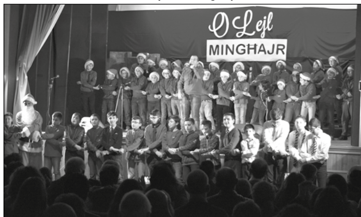
Everyone on stage for the finale