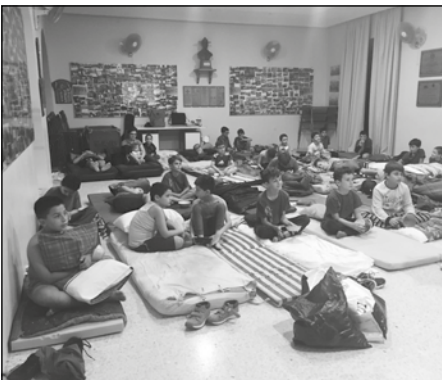
Sleepover number 1