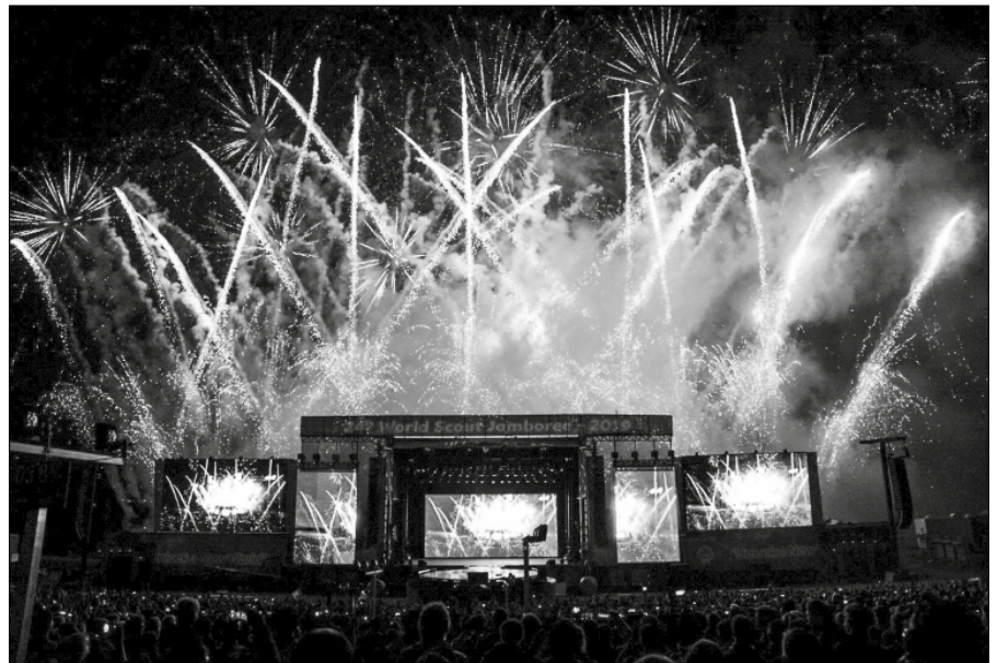
Magnificent fireworks light up the sky.

worldwide can play in protecting our planet. He explained that: "Global citizens are those who identify themselves not as a member of a nation, but instead