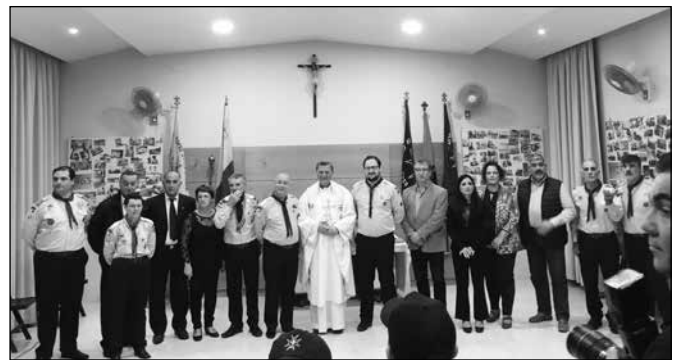
Group photo with guests, Council members and Scouters

Scout Jamboree and other Scouting symbols. These tippets were prepared in Italy and were used during certain celebrations at the Jamboree. A special one was ordered especially for the bishop.