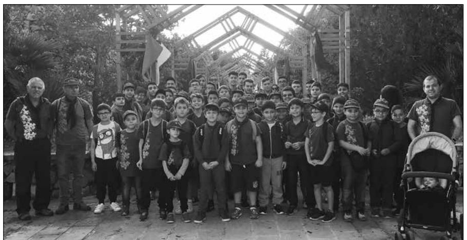
Group photo at the entrance to Ta' Qali Park