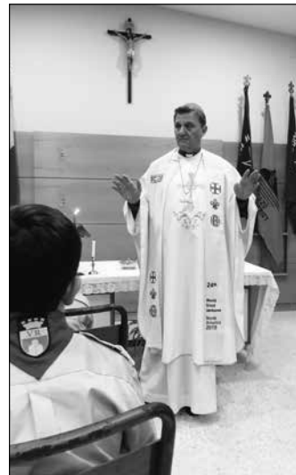
H.E. Bishop Mario Grech dons his new tippet with Scout emblems.