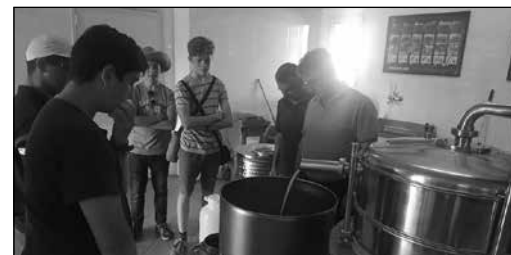
Olive picking in Sicily

The Unit helped out during the marquee lunch which was attended by parents and supporters. They served food, and of course, filled up their stomachs as well!