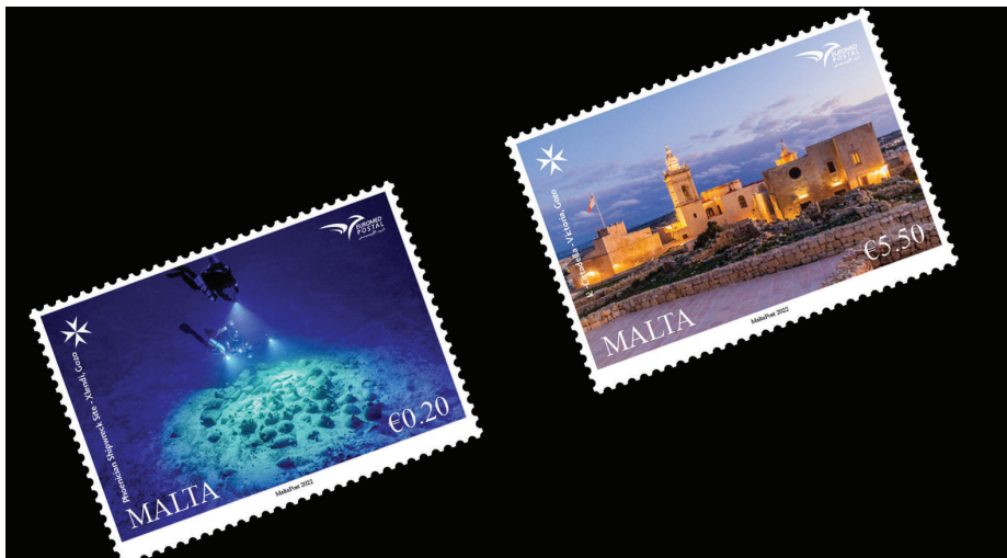
The shipwreck off the coast of Xlendi and the Gozo Citadel on stamps in 2022.