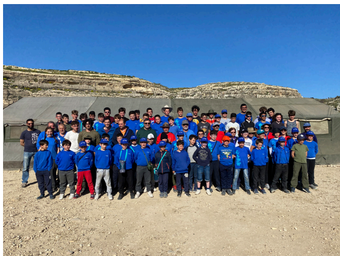
Group photo at Easter Camp

Germany and Hungary this summer. Such activities allow our members to share experiences, forge new friendships and build memories that they shall undoubtedly carry throughout their lives. In preparation for this, at the end of May, we hosted 2 leaders from each of the countries involved and together we planned this visit, discussed logistical issues and also visited a number of local landmarks, which shall be included in our event programme.