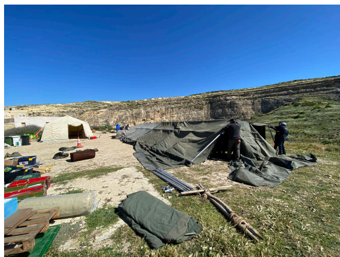
Up goes the new marquee tent