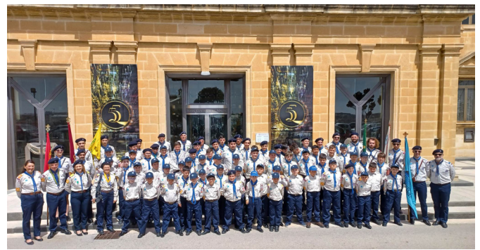
At the Annual Rally

Throughout this quarter, we also had the Annual Rally in Valletta, a highly-anticipated activity not only for our Group, but for the whole Scout and Guide Associations in Malta and Gozo. Through this activity, members from most of the local Scout and Guide Groups marched through the streets of Valletta - an event witnessed by many eager supporters. It was a spectacle to see so many uniformed members!