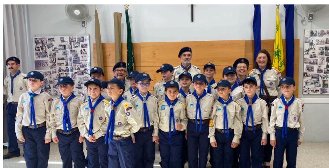
The newly invested Cubs, all 16 of them..... with the Group Scout Leader and the Cub leaders