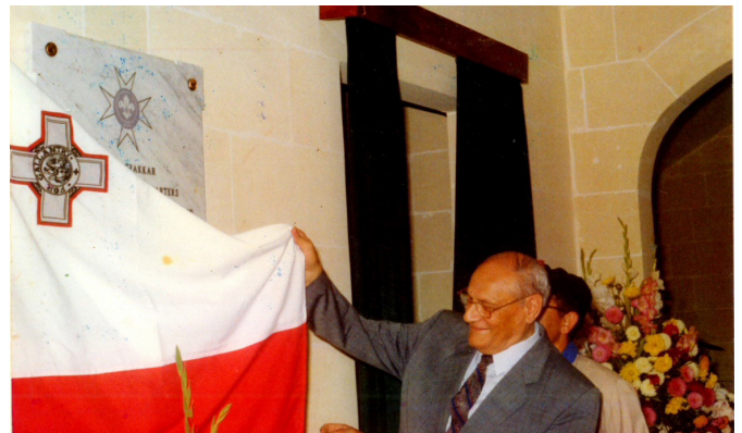
8.7.1989 – Official opening of the present headquarters in Sta Dminka Street by H.E. the President of Malta Dr Ċensinu Tabone

Ad multos annos, Victoria Scout Group!!!!