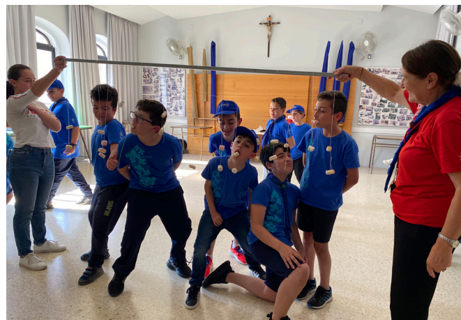
Eat me if you can, says the marshmallow .....