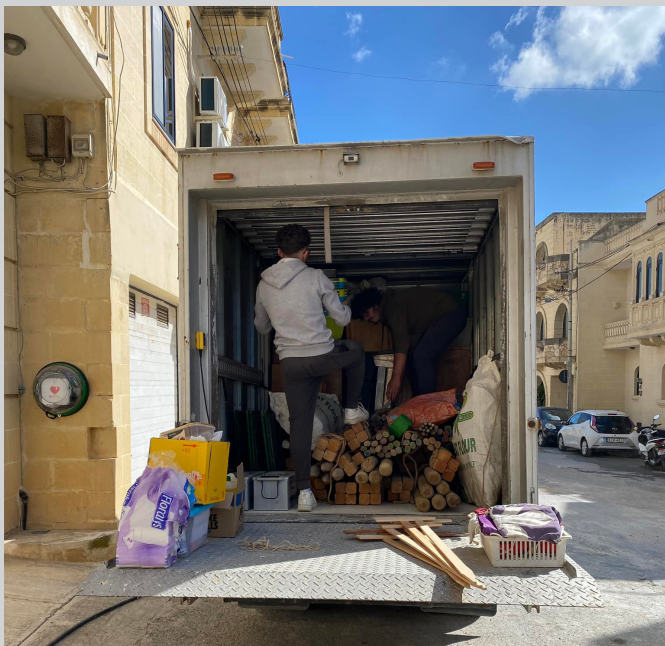
And we're off to Easter camp