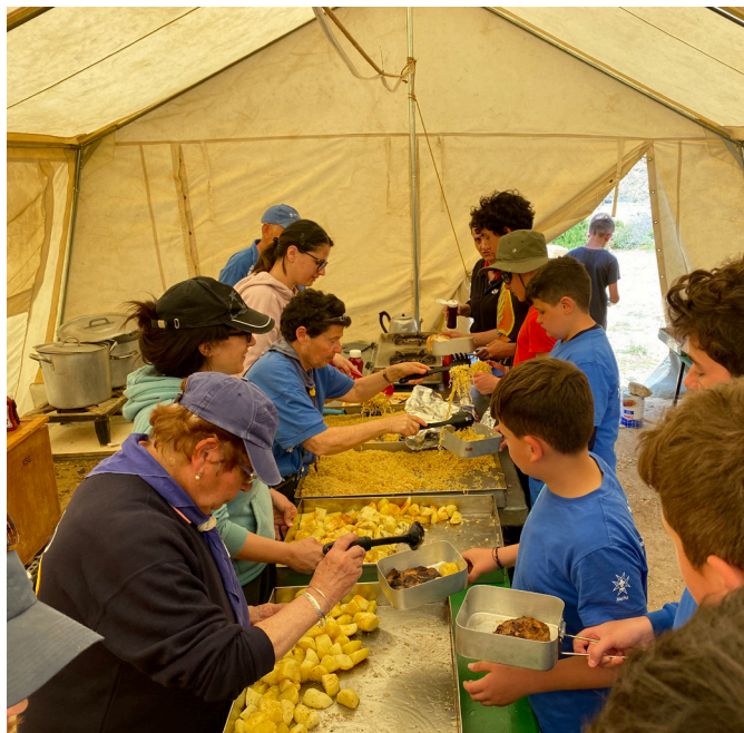
Food glorious food .....

Another Easter Camp has come and gone and left all those involved with lots of happy memories and experiences.