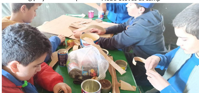
Preparing the Hobo stoves.