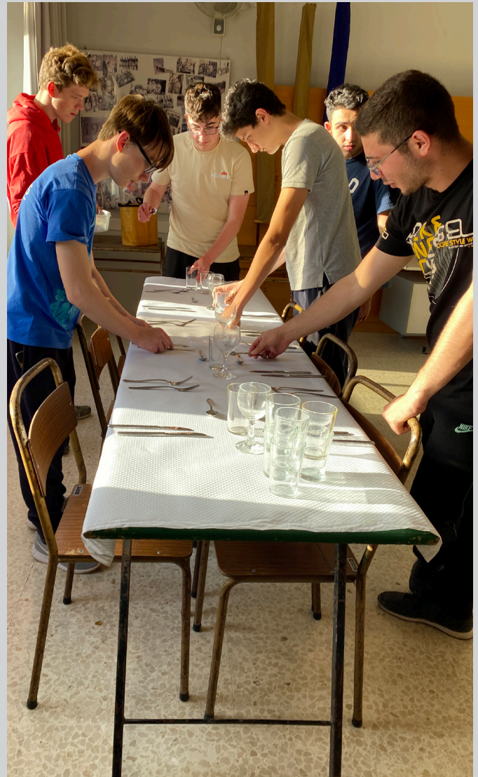
Helping out at the Friends of the Sick and the Elderly lunch

Yes, we can always count on the Venture Unit and Rover Crew to be there to give a helping hand. And you can rest assured that they always provide service with a smile.