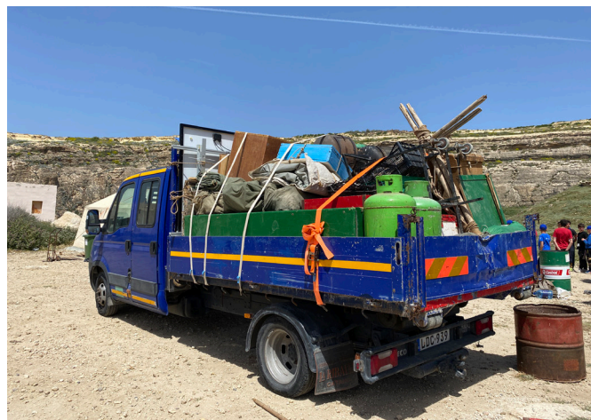
All packed and ready to return to headquarters at the end of camp