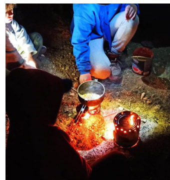
Hobo Stoves at camp