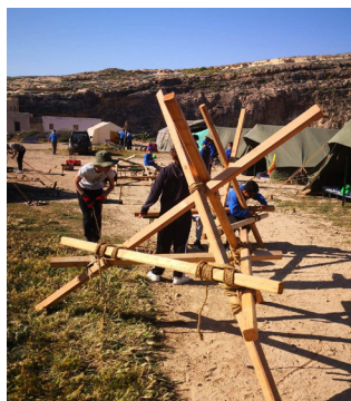
Pioneering projects at camp