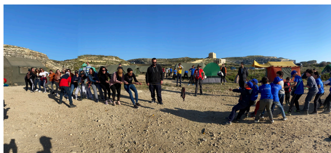
Go, Go, Go! Tug of war between the Cub Scouts and their parents at Easter Camp