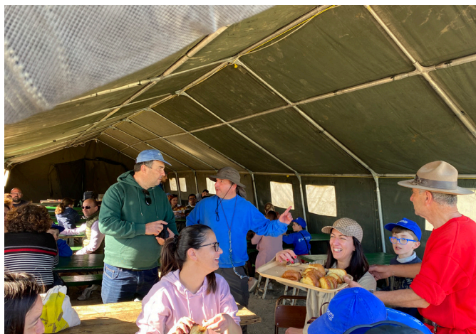
Parents as guests at camp