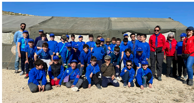
The Cubs and their leaders at Easter Camp