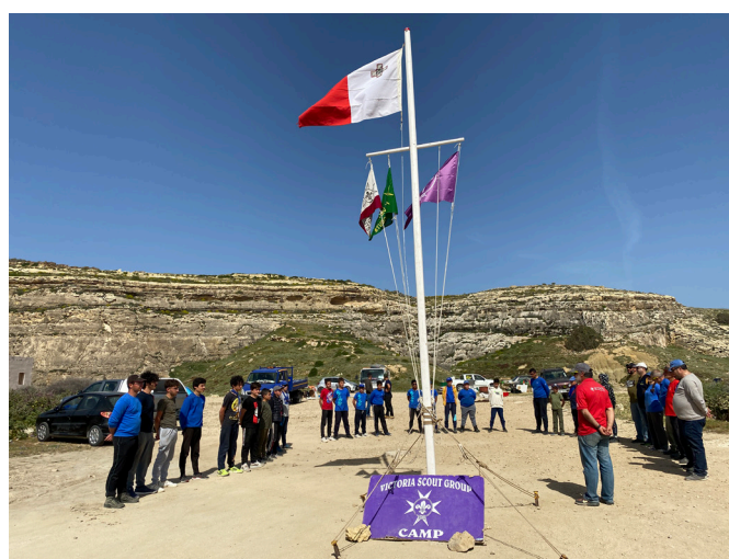
Flagdown at camp