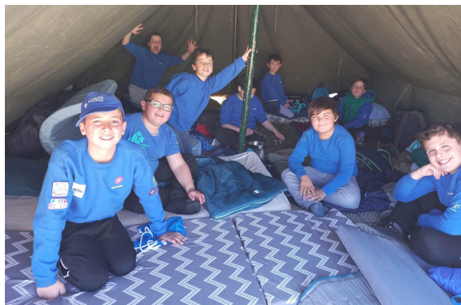
Welcome to our humble abode at camp, our tent.