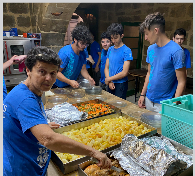
Santa Luċija dinner