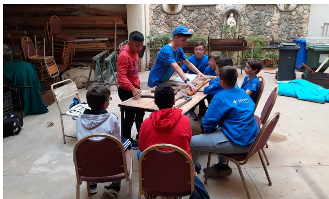
The Patrol Leaders take over the meetings.