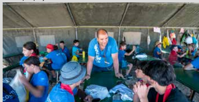
SL David and the Scouts discuss the camp programme.