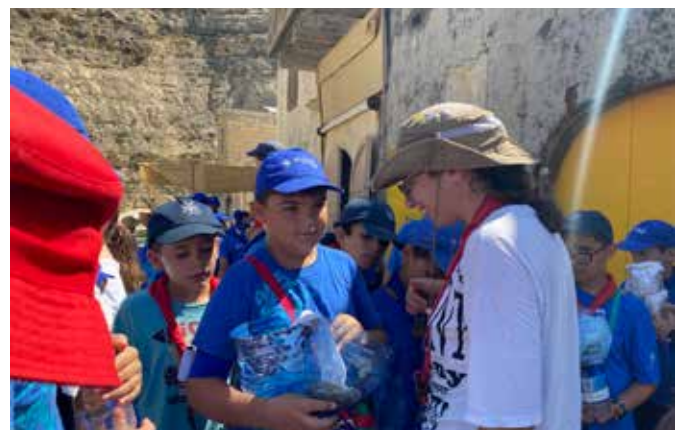
Water filtering experiments at the Inland Sea area

Cub prayer at camp: We give thanks for being here together in the name of Scouting. We ask that we may learn to work hard and play fairly. We ask to see the needs of others so we may help them. We ask for strength to do a good deed every day and to live to our Scout Promise. Amen.