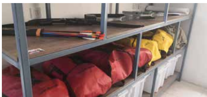
New shelving will house the equipment in the Venture and Rover room.