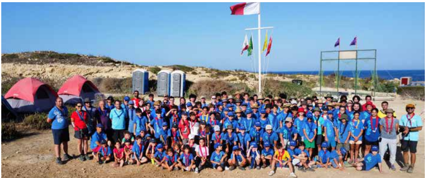
Group photo at summer camp

The Summer Camp this year was particularly special as we were joined by the 1 st Sliema Scout Group for several days. This joint camp offered a fantastic opportunity for leaders and members alike to work together and forge new friendships, embodying the essence of Scouting. Organizing a camp for over 150 people required