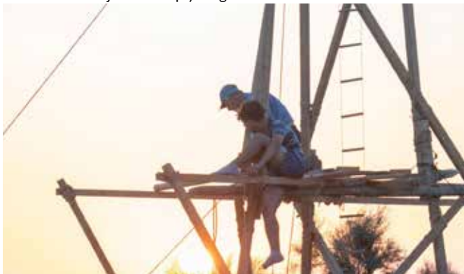
Seasoned Scout masters share their expertise with eager novices to build the tower.