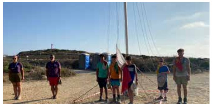
Flag down on Summer Camp 2024