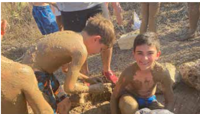
A little bit of mud therapy does wonders for one's skin. So they say.....