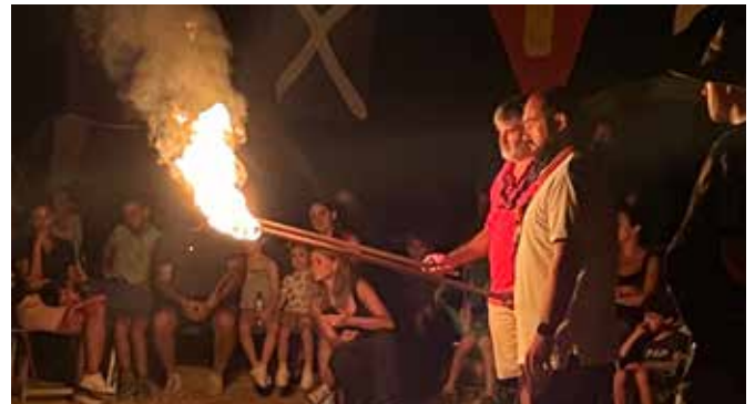
GSL Jesmond (Victoria) and GSL Timmy (Sliema) during the campfire