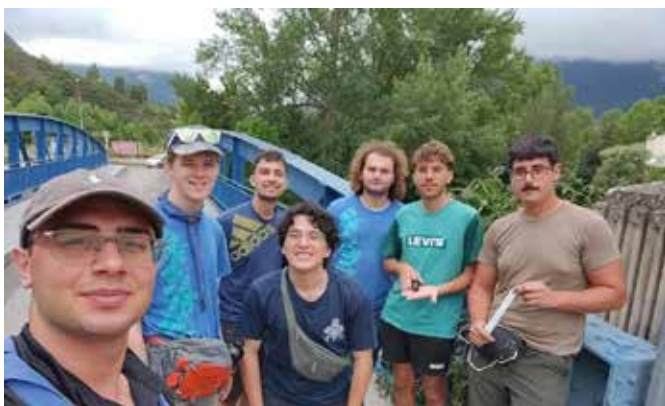
From Esperanza to Quillan

Heartfelt thanks go to Aġenzija Żgħażaġh for partially funding the trip through the BeActive Youth Scheme.