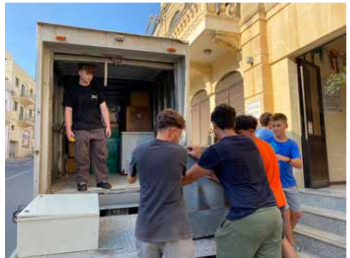
Getting ready for camp

From the Pyrenees to pioneering projects and everything in between, this summer has showcased the dedication, teamwork, and adventurous spirit that define our Rovers and Ventures. Their contributions highlight the strength of our Scout Group and reinforce their role as valuable members of the broader Scouting community.