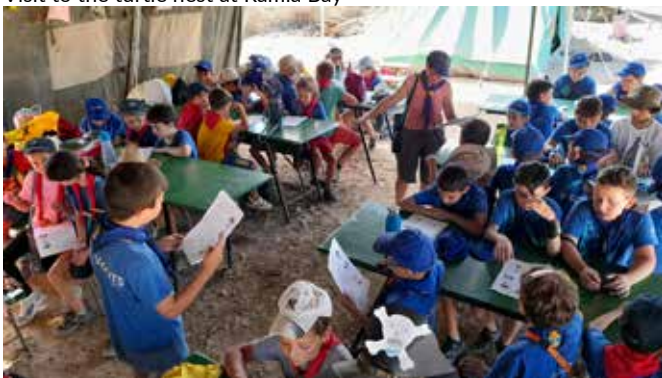
Rehearsing some sea shanties for the campfire