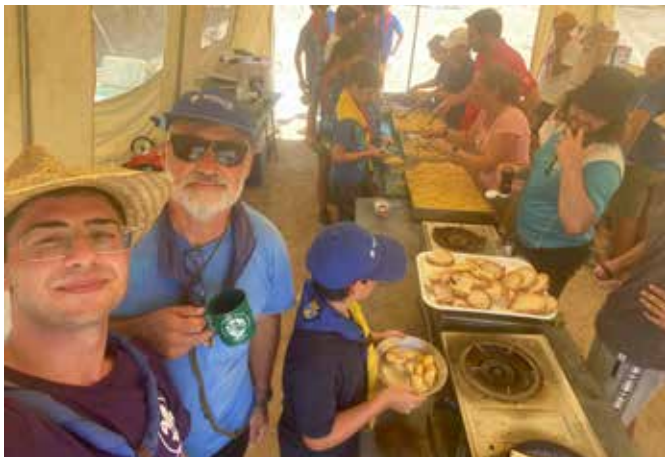
Scout Law # 13 A Scout is always hungry!