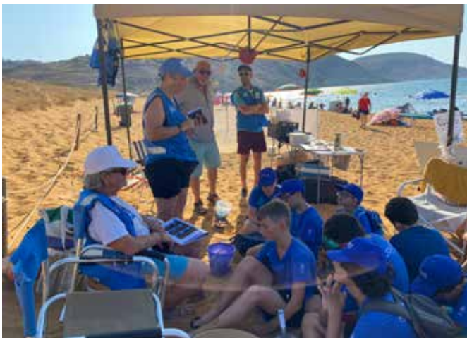
Visit to the turtle nest at Ramla Bay