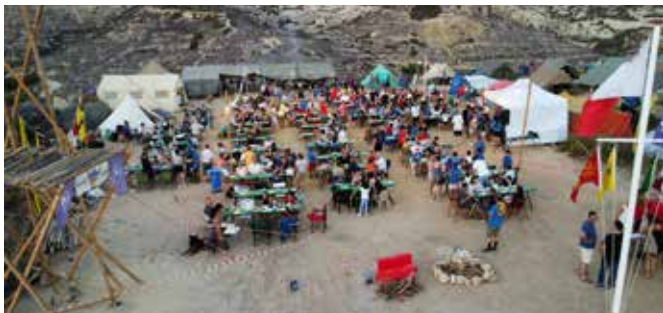
Aerial view of the campsite during the Group barbeque