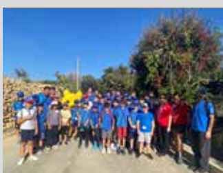
Clean Up the World activity at Marsalforn Valley