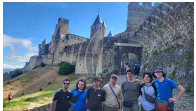
At the walled city of Carcassonne