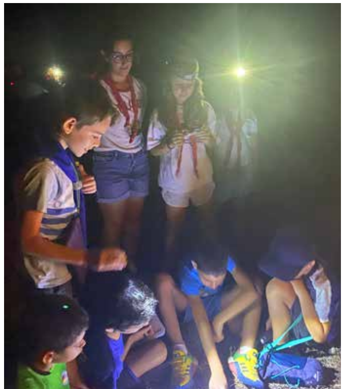
Morse Code session at camp