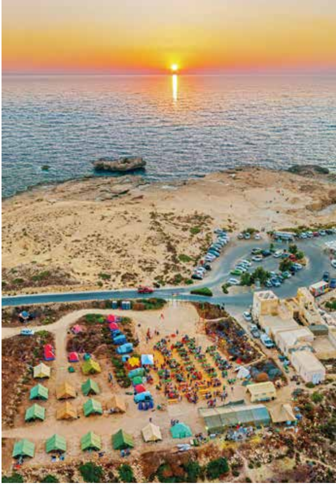
An aerial view of the campsite

significant planning and coordination, but thanks to the hard work of our leaders, the kitchen team and Camp Chiefs, we ensured a positive experience for everyone. One of the highlights was the BBQ and Campfire, which attracted nearly 500 participants – a remarkable achievement that wouldn't have been possible without the help of all the volunteers involved.