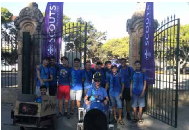
Fun and competition time at the Go-Kart Rally