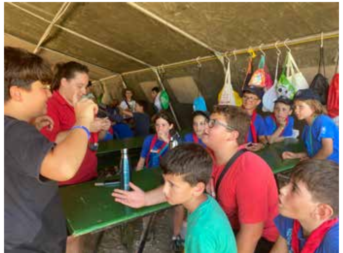
Guess what? Camp charades is fun....