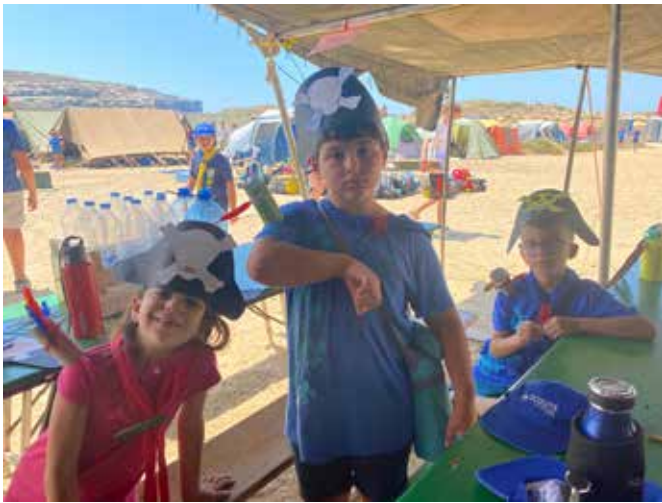
Junior pirates in full regalia with their hats and trusty parrot