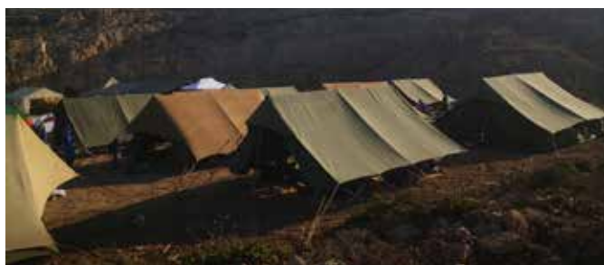
Old tents which were given a new lease of life