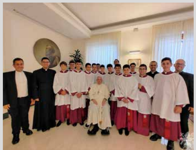
The altar boys meet Pope Francis during a private audience.