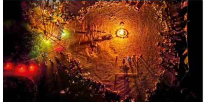
Aerial view of the campsite during the campfire