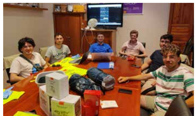
On the eve of departure, the Rovers meet at headquarters and checked if they 'are prepared'.