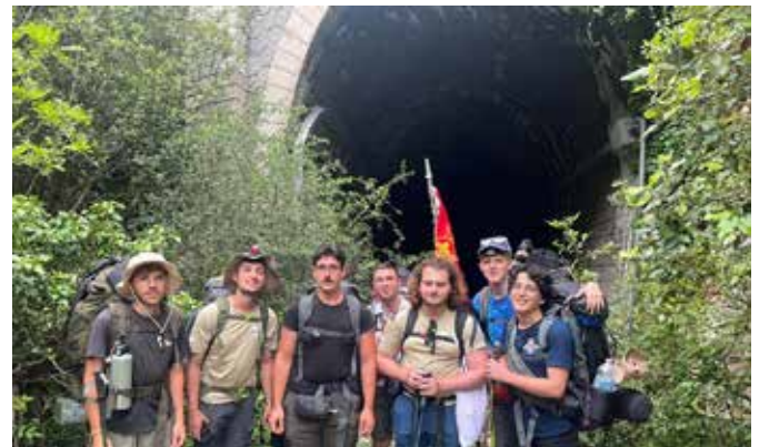
Hiking from Quillan to Cailla