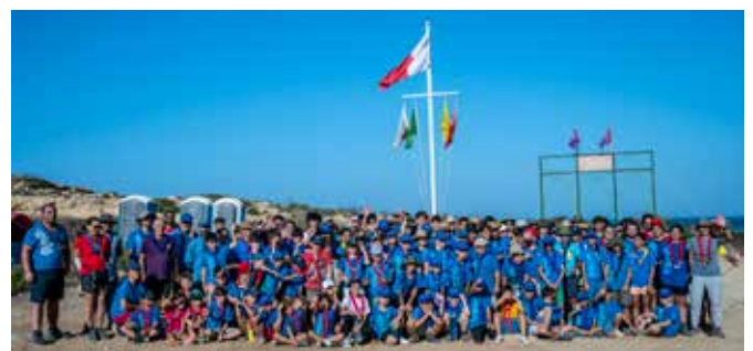
Group photo of the Victoria and Sliema Scout Groups at camp