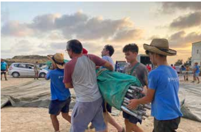
Striking camp and packing all equipment is quite a task.