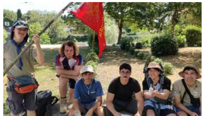
Hiking through Limoux, Esperanza and Alet-les-Bains