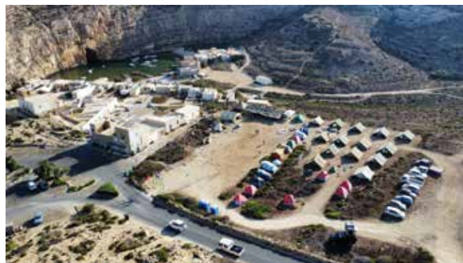
Our camp, our home - an aerial view

Camp is now over but the memories and the spirit will linger on in our hearts and minds. Well done to all those who made it happen! This includes members, leaders, Council members, parents and grandparents, sponsors for the barbeque lottery, and other volunteers who responded to our call for help and gave a helping hand whenever and wherever this was needed. Thank you!