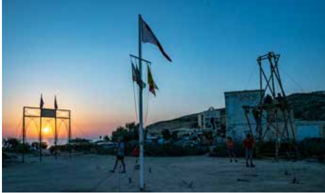
Sunsets at Dwejra are simply magnificent.