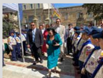
Guard of honour to H.E. Myriam Spiteri Debono, President of Malta