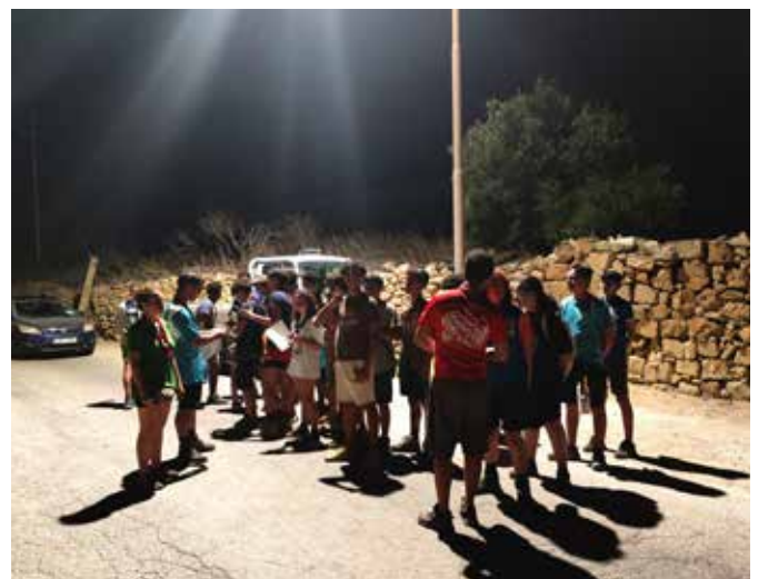
The Victoria Ventures and Rovers and the Sliema Ventures are off on a very particular night hike.