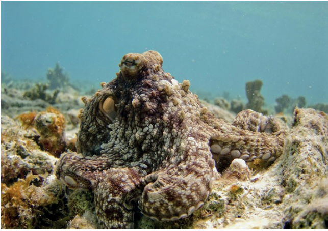
Figure 2: The white-spotted octopus ( Callistoctopus macropus ), a rare and elusive species found along Gozo's shores, is renowned for its striking appearance and nocturnal habits. Preferring shallow, sandy habitats, this octopus often evades detection, making sightings a treasured experience for divers and marine biologists alike. Its presence highlights the rich biodiversity of Gozo's waters.

octopuses have eight arms, all of which are lined with suckers and are highly flexible, allowing them to manipulate objects, escape from predators, and interact with their environment in a variety of ways.