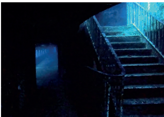
Figure 1: The iconic staircases of the MV Karwela, a former passenger ferry that sank off the coast of Gozo in 2006, now serves as an artificial reef and a popular diving site. The vessel's wreck, including these staircases, has become an important feature of the local marine ecosystem, providing shelter for a variety of aquatic species, including octopuses, and contributing to the biodiversity of the surrounding waters.

Gozo, part of the Maltese archipelago, is famed for its picturesque landscapes, crystal-clear waters, and diverse marine ecosystems. For marine biologists and scuba divers alike, Gozo's underwater world offers an exceptional opportunity to explore a thriving aquatic community.