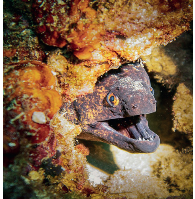
Figure 3: The yellow-edged moray eel ( Gymnothorax flavimarginatus ) interacts with octopuses as both predator and competitor, sharing habitats and vying for similar prey. These interactions highlight the dynamic balance within Gozo's marine ecosystem.

In some cases, they even use tools such as shells or debris to create makeshift shields or shelters, demonstrating a level of foresight and adaptability