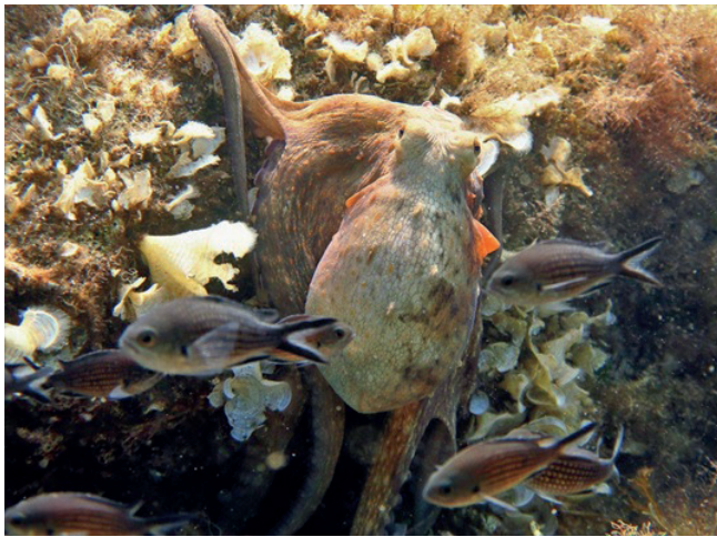
Figure 4: The pale octopus ( Eledone cirrhosa ). A rare sighting of an Eledone octopus, spotted while diving at Reqqa Point, Gozo. This species, recognised for its pale body and smooth texture, is typically found in rocky habitats where it uses its camouflage to evade predators.

of certain behavioural adaptations in males, such as employing strategies to minimise conflict during courtship.