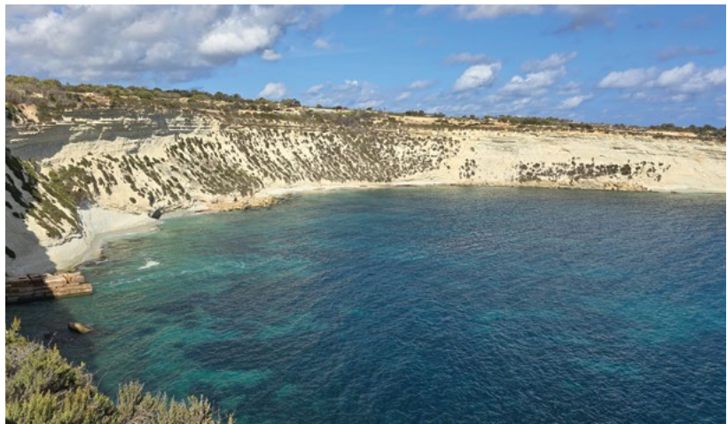
Top: View of Ras il-Fenek, the peninsula dividing the two bays under study. Bottom: General view of Il-Hofra ż-Żghira and the thermal effluent.

surprisingly high – mainly driven by thermophilic or opportunistic species like the native damselfish.