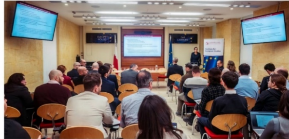
Photos from the conference