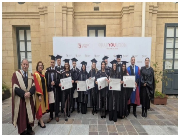
Photo of 2025 Graduates, Masters in European Politics, Economics and Law