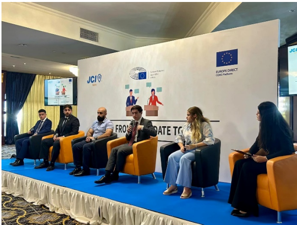
Panel of youth representatives