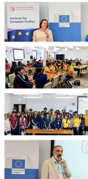
Photos from the Schools Quiz

On 7 May, the Institute for European Studies in organised the annual Europe Day Quiz Night at Hospice Malta. 79 participants competed in the quiz (in teams of three and four) and these included current students, alumni as well as other students from University of Malta. The quiz was won by the 'Retirement Home' group, followed by 'Kant believe we're still here', 'Miggy's Angels', 'Jefers' and 'Schenigenn'. Also, during the event, funds were collected for Hospice Malta, with the total donation amounting to EUR205.