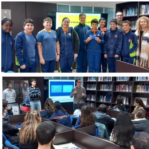
School students at the Institute's Library

Also, during 2024-2025, the Institute hosted several schools in the Institute's library. During these visits, students were given a presentation on the courses offered by the Institute and possible career paths.