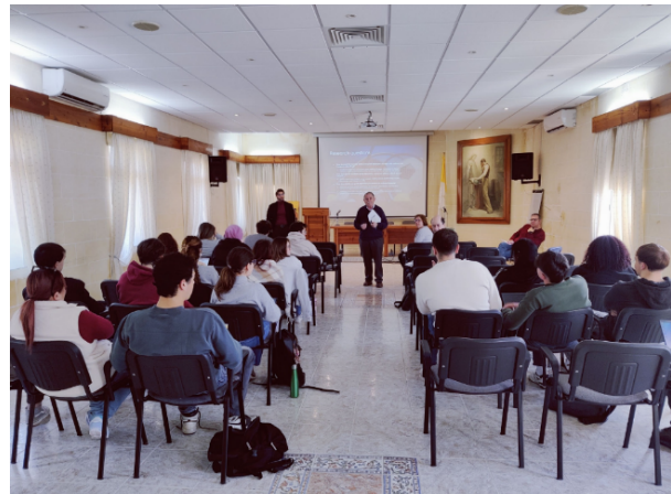
Presentations during the workshop

A full list of the dissertation titles can be found at the back of this newsletter.