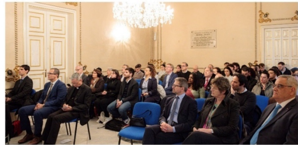
Photos from the event