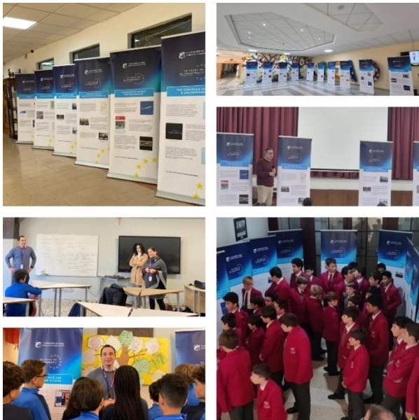
Exhibition panels & outreach in various schools

Also, during 2024-2025, the Institute hosted several schools in the Institute's library. During these visits, students were given a presentation on the courses offered by the Institute and possible career paths.