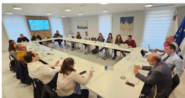
One of the meetings organized between the Europe Direct Information Centres and the European Commission Representation in Malta

The Institute for European Studies Library (EDC) is part of the Europe Direct Network, and participates in quarterly coordination meetings organized between the Europe Direct Information Centres and the European Commission Representation in Malta. The EDC also assists in the organization of events organized by the Europe Direct Information Centres and the European Commission.