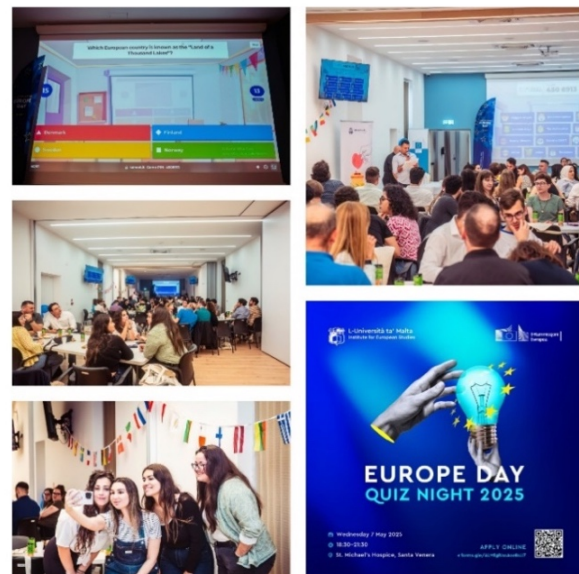
Photos from the Quiz Night

On 7 May, the Institute for European Studies in organised the annual Europe Day Quiz Night at Hospice Malta. 79 participants competed in the quiz (in teams of three and four) and these included current students, alumni as well as other students from University of Malta. The quiz was won by the 'Retirement Home' group, followed by 'Kant believe we're still here', 'Miggy's Angels', 'Jefers' and 'Schenigenn'. Also, during the event, funds were collected for Hospice Malta, with the total donation amounting to EUR205.