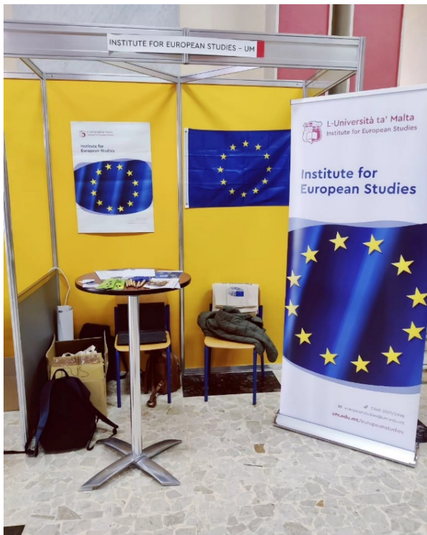
The Institute's stand at the fair