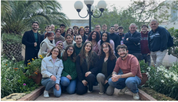
Photo of students and staff at the dissertation workshop