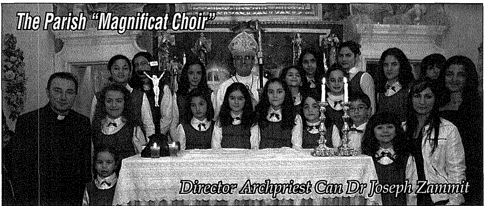
The Parish "Magnificat Choir"

What a different world it would be if we were ready to go that extra mile when friends and foes are stranded and need that little push. When we are ready to open up our heart to the poor, the powerless and the friendless.