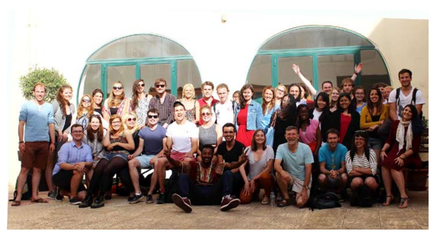
The students and staff from five universities after the completion of a 10-day field experience in Gozo.

On 16<sup>th</sup> and 17<sup>th</sup> July, the Students Advisory Services of the University of Malta were available at the Gozo Campus to provide prospective