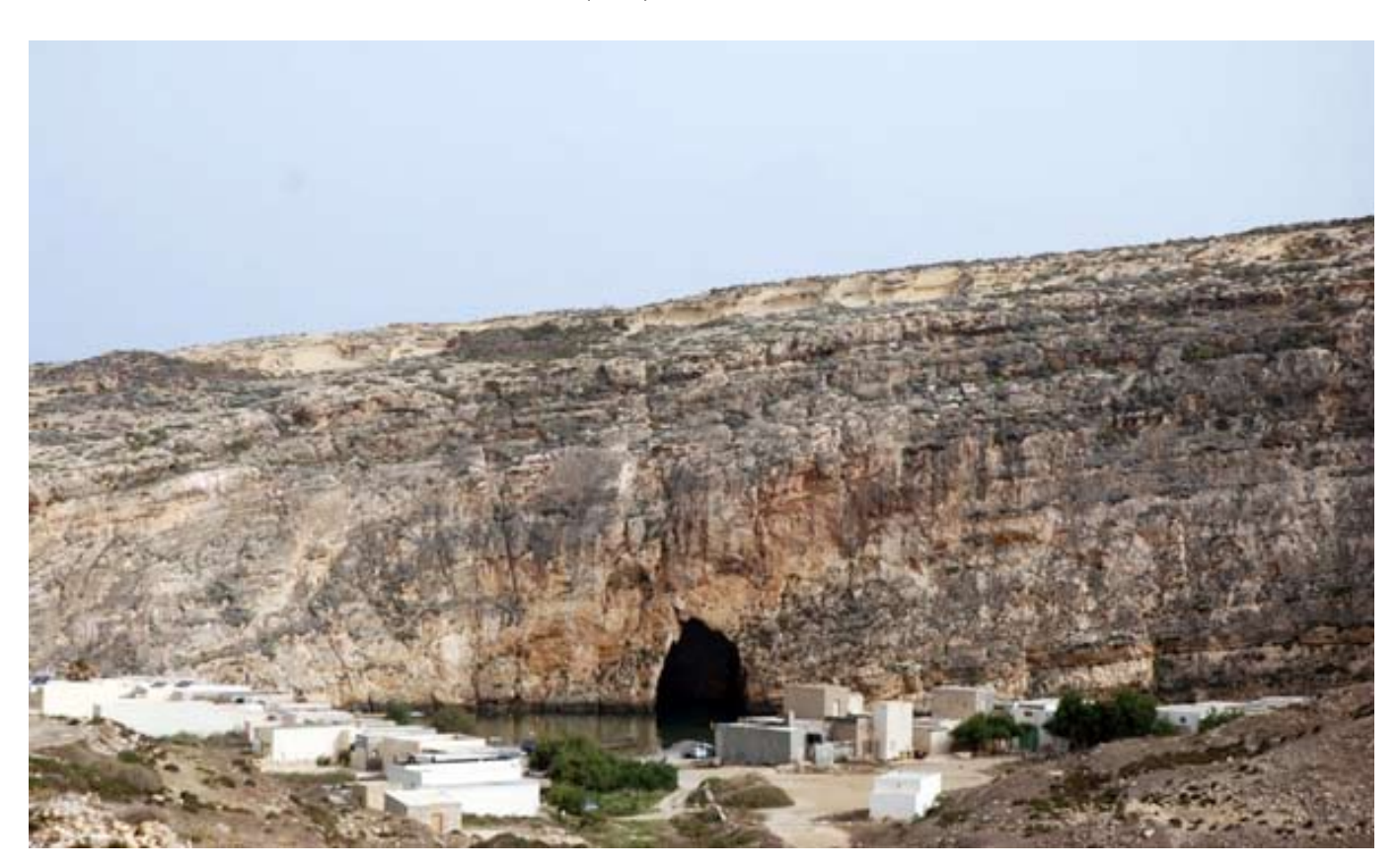
The students following the MA in Islands and Small States Studies visited Dwejra as part of their fieldwork in Ecology and Biogeography of Islands. During this fieldwork students drew a report on the geological formation of the area and on its ecological aspects.

A number of short courses were also offered at the Gozo Campus. The Lace Making Programme organised two courses entitled 'Introduction to the Art of Making Lace' and 'Making a Lace Jacket'.