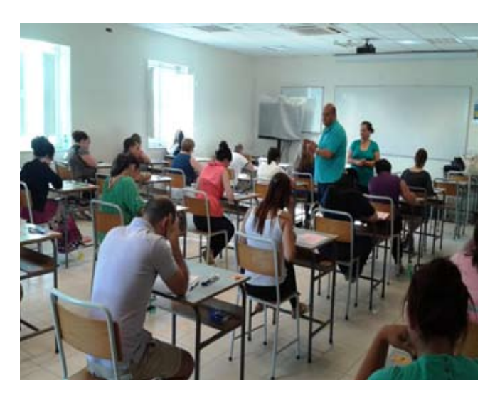
An examination in progress.

Once again the University of Malta offered the facility to almost all Gozitan students following courses at the Msida Campus to sit for their end-of-semester examinations in Gozo, without the need to cross over to Malta. More than 700 examinations were held, both at the University Gozo Campus in Xewkija and at the Examination Centre in Victoria.