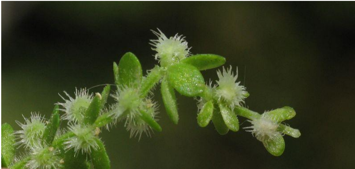
Figure 6: V. muralis var. hirsuta Gussone found on Mistra Rocks, Gozo with long and numerous bristles and a dorsal cornule (total 4 cornules) in its fructiferous body.

All photographs in this article were taken by the author himself. Stephen Mifsud (www.MaltaWildPlants.com) ©