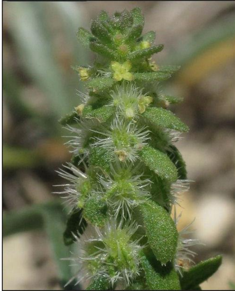
Figure 4: Tip of stem showing flowers and fruit of Valantia hispida