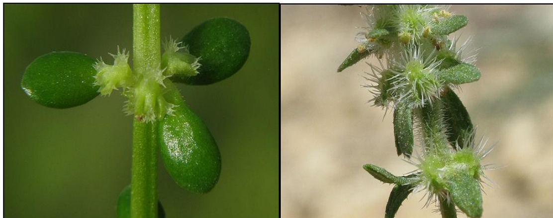
Figure 3: Comparison of the fructiferous body of Valantia muralis (left) and V. hispida