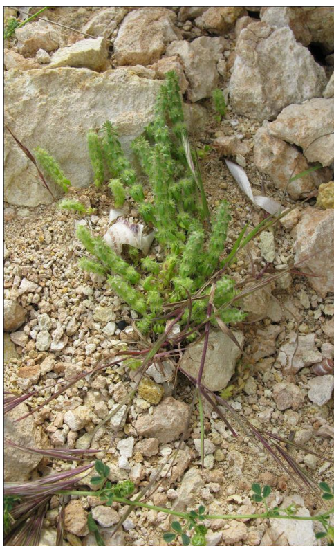
Figure 1: Habitat and habit of Valantia hispida , Xatt l-Ahmar, Gozo (Malta)