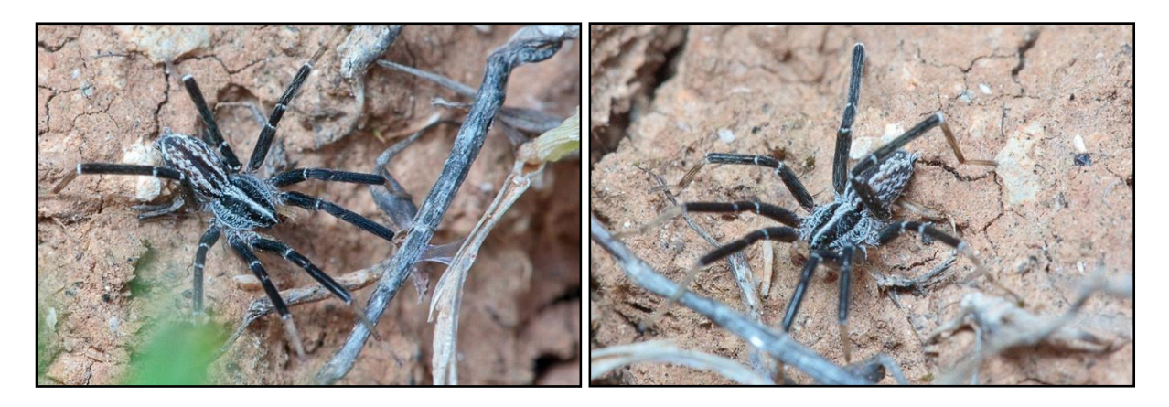
Figure 2: Male Zora sp. from Ghar is-Sienja, limits of l-Imgarr, Malta.