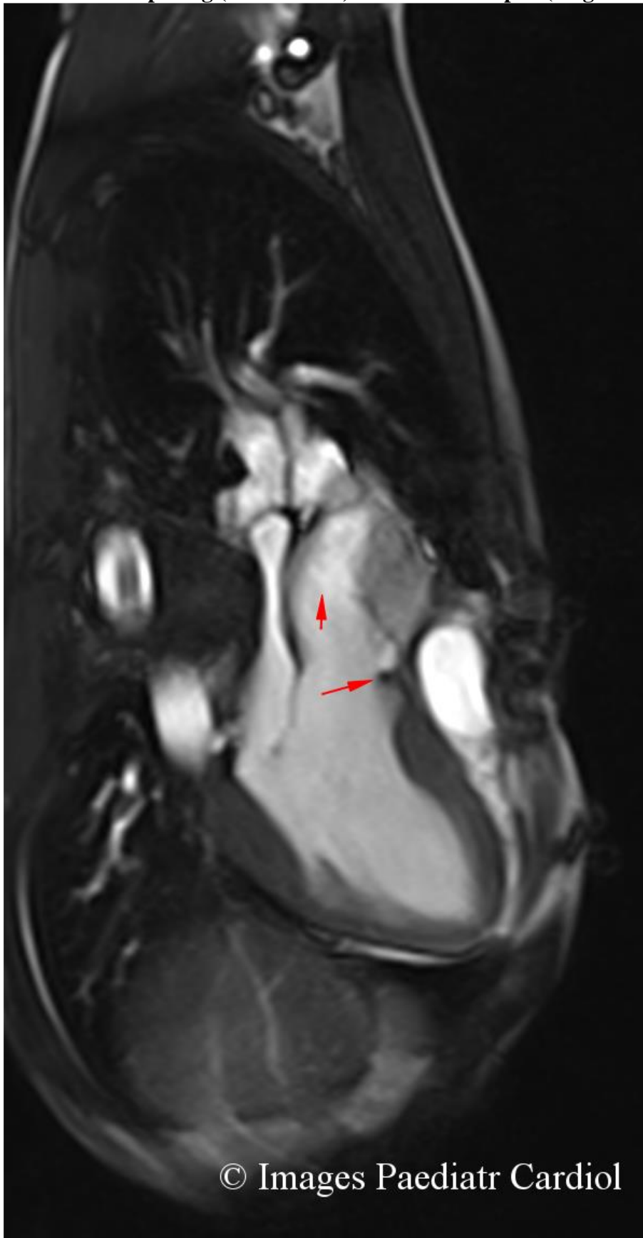
Figure 2. Left ventricular outflow tract, CMR cine image, systolic still frame, showing eccentric aortic opening (short arrow) and subaortic spur (long arrow).