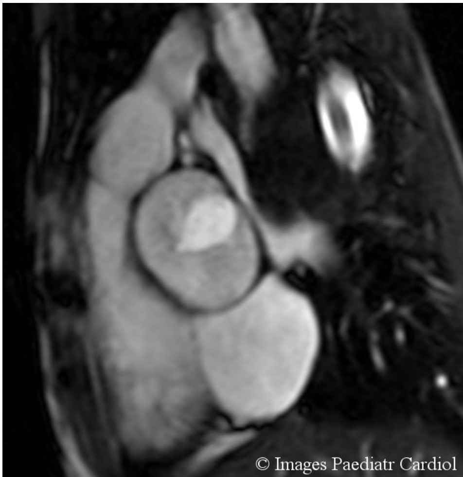
Figure 1. Aortic valve, CMR cine image, systolic still frame, showing unicuspid unicommissural aortic valve.

CMR showed unicuspid unicommissural aortic valve with normal valve area and without significant regurgitation. A sub-aortic spur was detected, without outflow obstruction. There were no signs of recoarctation nor residual septal defects; both ventricles were of normal size and function (figures 1-3).