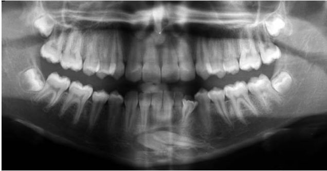
Figure 1. Dental panoramic tomography showing transmigrated lower left canine and lateral incisor. A supplemental lower left premolar is also present. Retained deciduous second molar roots are visible distal to the lower second premolars.

one year later showed no further abnormality. The patient accepted to have her carious teeth restored, but declined any sort of orthodontic treatment.