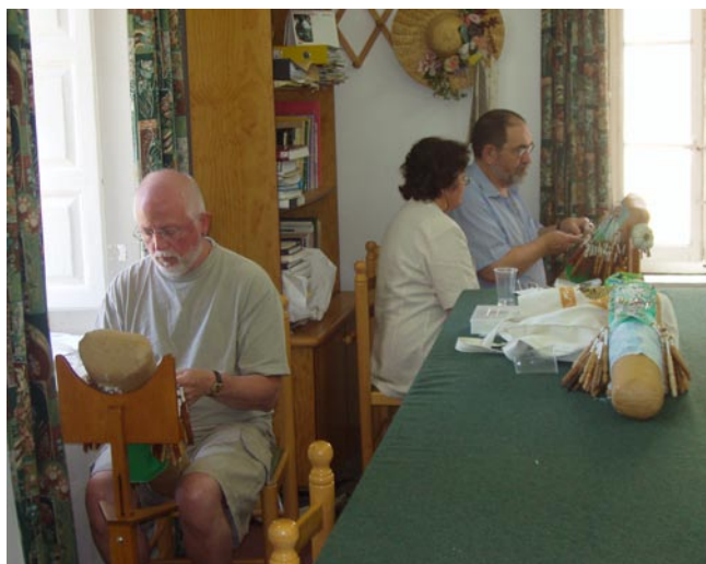
A practical session of the course in progress

The programme of the course also included various activities and excursions. The participants had the opportunity to visit a number of museums, churches and private lace collections, as well as other historical landmarks on the island. They also visited a local village festa and were taken for a full day excursion in Malta.