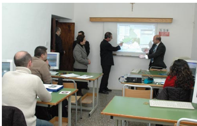
The Prime Minister making a point during a lecture on G.I.S. applications, as part of a course leading to the Masters in Islands and Small States Studies.