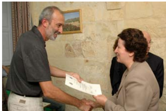
The Hon. Giovanna Debono awards a certificate to a participant who attended a course in Agriculture.

part of a project part-financed by the European Union under the Structural Funds Programme for Malta 2004-2006 European Social Fund. The courses related to Agriculture, Business Studies, E-commerce and IT and Environmental Planning and Management.