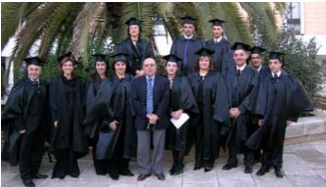
The students who received the Diploma in Commerce.