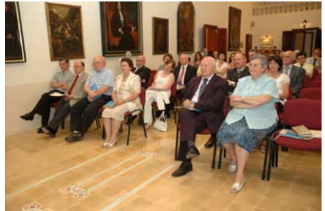
The audience present during the inauguration.