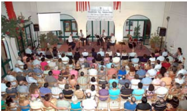
The event was attended by a large audience.