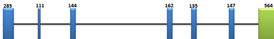
Figure 2: PLAUR cleavage products. PLAUR is a 3 globular domain protein attached to the cellular membrane via a GPI anchor. Cleavage occurring on the membrane bound receptor can either be proteolytic or glyco/lipolytic. Glycolytic and lipolytic cleavage occurs at the GPI anchor by substances such as Phospholipase C & D, and results in the formation of a soluble form of the receptor which structurally mirrors the corresponding membrane bound receptor. Proteolytic cleavage occurs in the linker region between DI and DII and results in the loss of DI to form a DII/DIII fragment which has chemotactic activity.