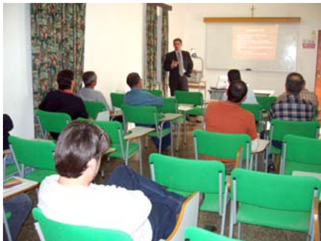
One of the lectures of the Organic Farming course in progress.

In February a set of courses offered by the Ministry for Gozo, and co-financed by the European Social Fund came to an end. In March another set of similar courses commenced. The subjects consisted of Basic English, Basic Maltese, and Basic Reading and Writing Skills. Concurrently a set of courses dealing with Organic Farming, Soil Conservation, Rabbit Production, Sheep and Goat Cheese Production, Animal Health and Welfare, New Standards and Product Quality, and Plant Health Pathology also started. All courses were attended by a very good number of Gozitans and many participants showed their interest in attending similar courses in the future.