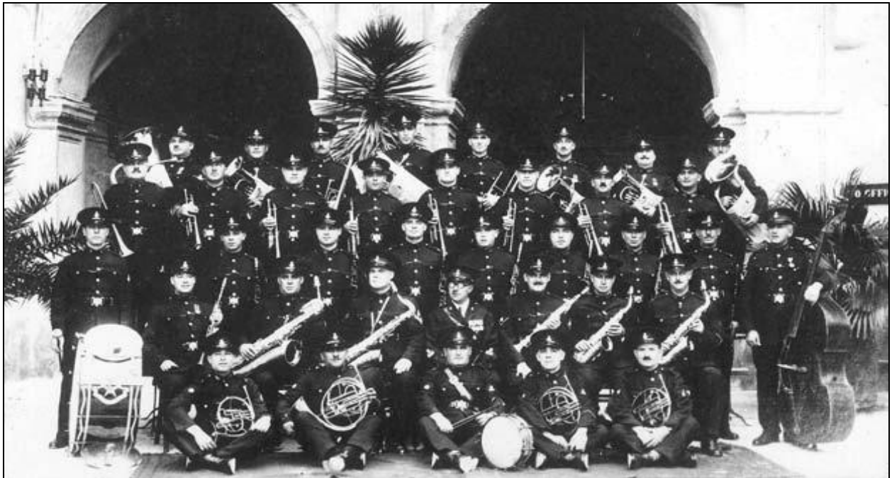
The Malta Police Band in the 1920s 33

a treasury audit recommended that the orchestra constituted an unreasonable expense, and should be disbanded. In return, the treasury eventually agreed that the members of the orchestra could continue to serve until they retired. Thereafter, whenever a member was due to retire, a successor was secretly appointed, to take on the role his predecessor. By the time war broke out in 1939, there had been no reduction in the number of players in the orchestra. 32