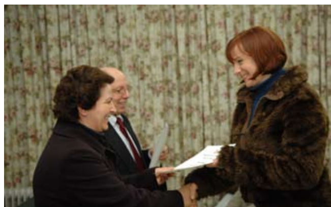
The Hon. Giovanna Debono presenting a certificate to a successful participant.

Minister Debono, commenting on the activities of the Gozo Campus, said that the partnership between the Ministry for Gozo and the University of Malta (Gozo Campus) is resulting in fostering education at all levels in Gozo and therefore making an important contribution to Gozitan society. Referring to the short courses offered at the Campus, Minister Debono said that she was very pleased that these courses were attracting participants from all walks of life and different age groups.