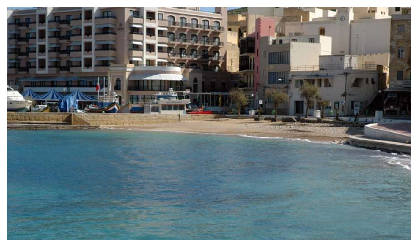
Marsalforn - a major tourist attraction in Gozo.

In addition, tourism tends to increase the use of environmentally dangerous products, such as emissions of toxic gases from cars and power stations. Again here it should be said that the main culprits in this regard are local residents, but tourism intensifies the generation of harmful waste.