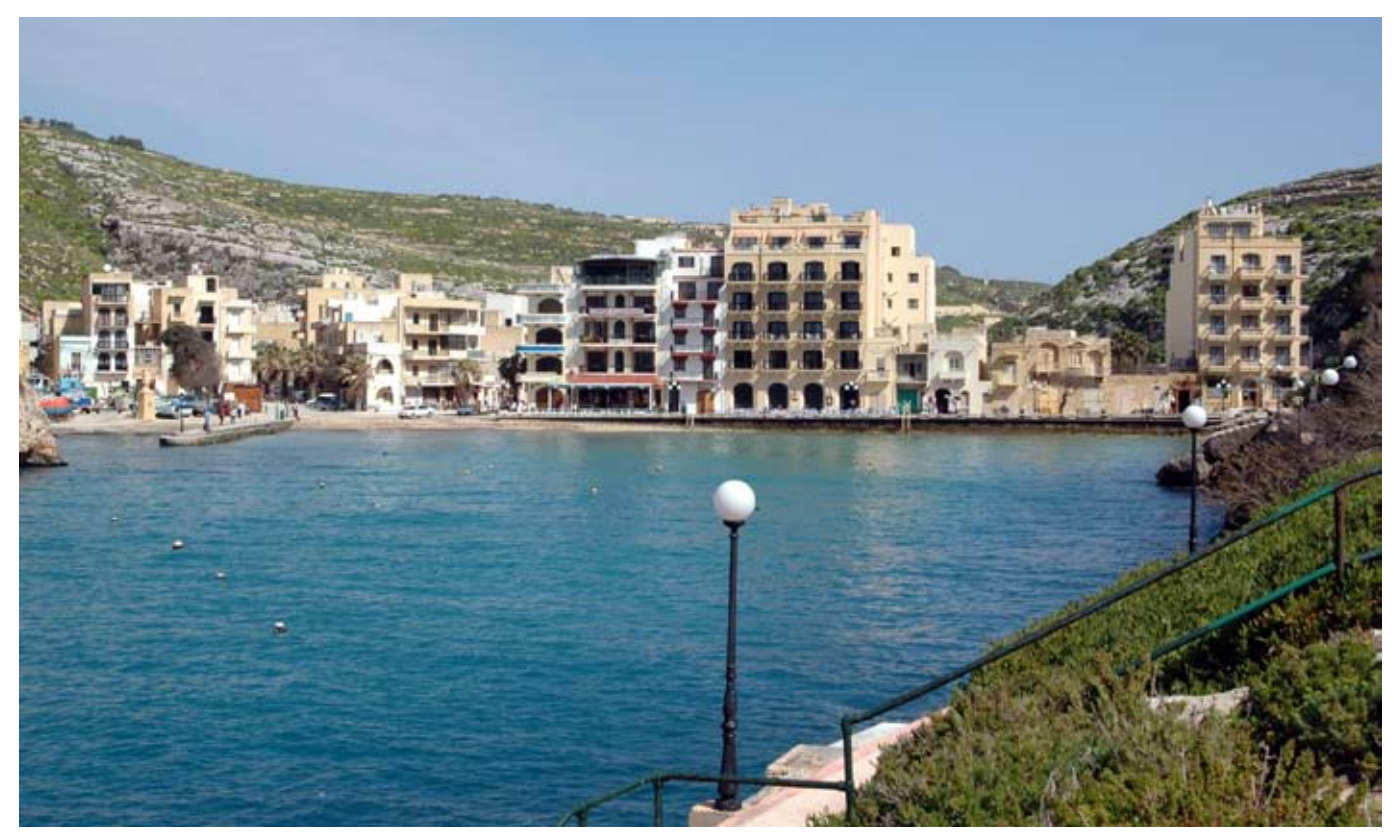
Xlendi Bay - another tourist attraction in Gozo

been a slowing down of developments which harm the environment.<sup>2</sup>