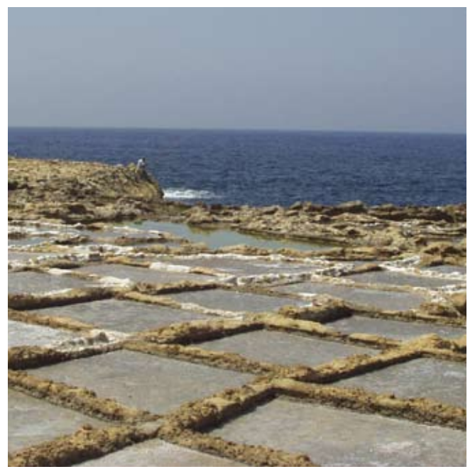
The salt pans at Qbajjar, Marsalforn - often featured in tourist brochures publicising Gozo.

One possible solution sometimes proposed to reduce the environmental impact of tourism is to replace "mainstream" tourism with "alternative" tourism, with the intention of attracting more responsible tourists and reducing inflows. The question arises here as to whether or not small islands like Gozo