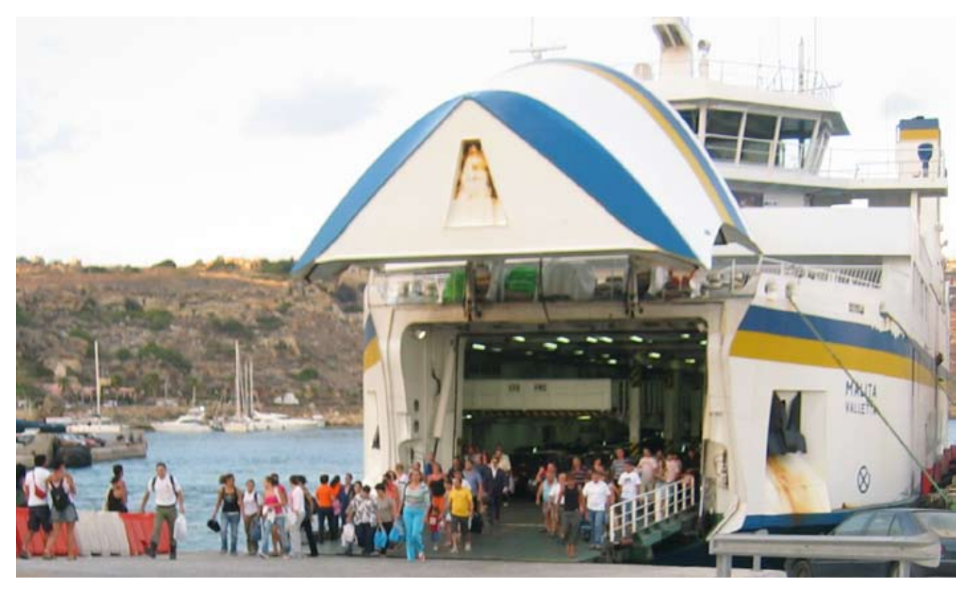
Tourists disembarking at Mgarr, Gozo, some years ago before the Gozo ferry terminal was built

The paper is divided in six sections. Section 2, which follows this introduction, briefly discusses the economic impacts of tourism on small island jurisdictions, while Section 3 assesses the environmental impacts. Section 4 focuses on Tourism in Gozo, referring to some problems faced by this industry. Some pre-emptive and corrective measures for the promotion of sustainable tourism