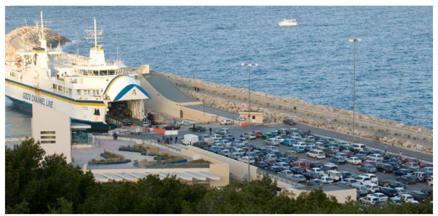
An infrastructural requisite for attracting tourists to Gozo.

such as lace-making, filigree work and pottery. Demand by tourists for these products has rendered their production economically viable.