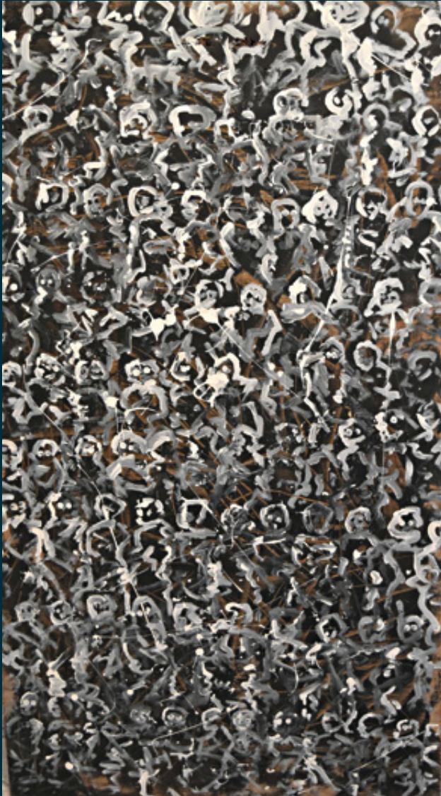
Untitled 1 by Lara Gove

This artwork is part of a series interpreting a text known as Cities and the Dead 4 which is found in Italo Calvino's book Invisible Cities . The painting reflects a state of decay, an entire city turned into a burial ground with confined spaces with restricted movement.