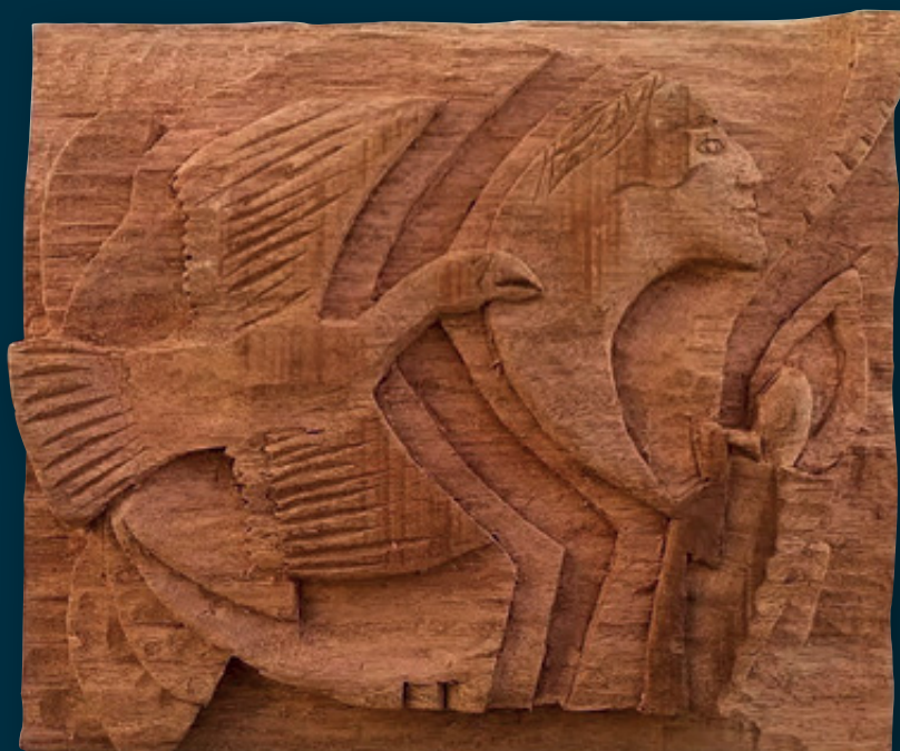
Wooden Sculpture no.1 by John Paul Muscat

Prostitution is known as the oldest profession. It is also the one with the highest human cost. This artwork reflects the pain female prostitutes feel contrasted by the coldness of the men who fuel the business. Attard was inspired by news items on these issues, and her belief that more measures are needed to bring an end to the business that fuels the objectification of women.