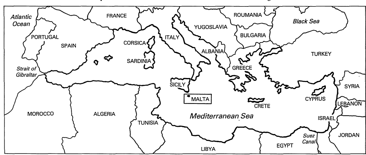
Map 1: Location of the Maltese Islands in the Mediterranean Region