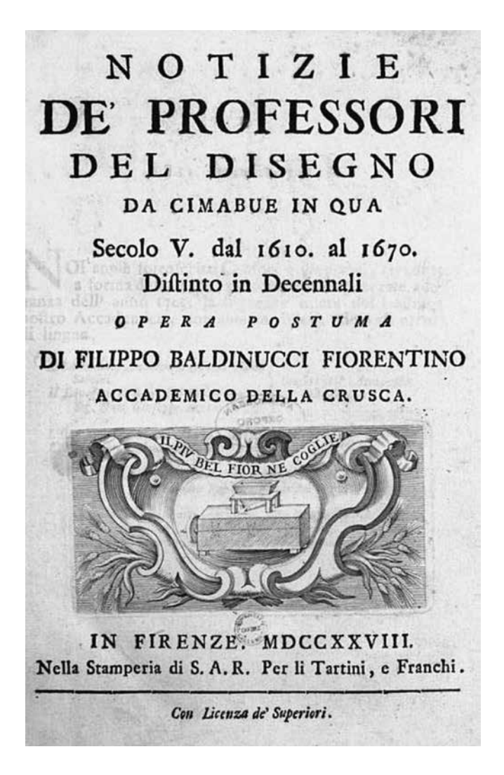
Figure 6. Frontispiece of Notizie de' Professori del Disegno by Baldinucci (Florence. 1728).

walls of the earlier building were now magically transformed by means of an arched architectural feature introducing - in the post-tridentine manner of Carlo Borromeo's Instructiones Fabricae et Suppellictillis Ecclesiastiche of 1577 - the central axis to the church leading to the high altar. Mattia Preti's interventions in the entrance area of the Conventual church suggest that he was not only aware of the Borromeo's directives