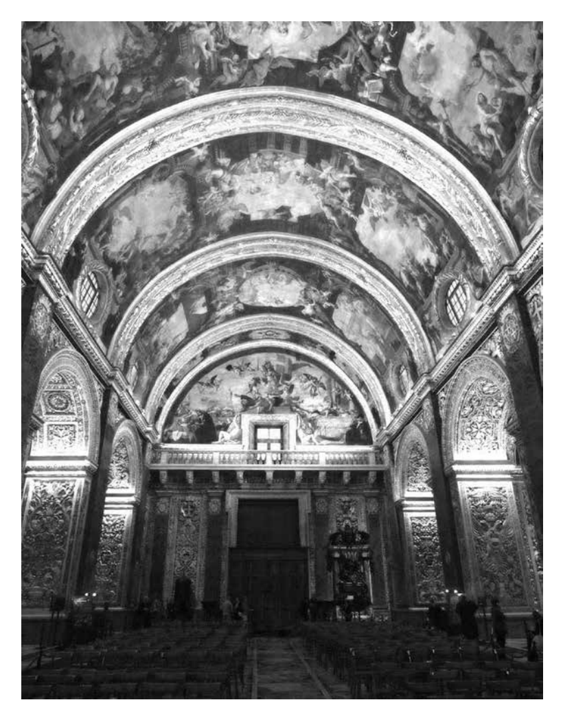
Figure 7. Interior of the Conventual Church of St. John in Valletta.

and the faussebraye overlooking Pieta - thus further protecting Valletta from the landward side - but also build the magnificent girdle wall around Fort St Elmo, thus firmly integrating this fortress within Valletta and, besides, embellishing the entrance to the Grand Harbour thus, according to Pozzo, "perpetuating the memory of the Grand Master." In view of the Grand Master's great esteem for Mattia Preti and in view of the friendship that went back to the building of Sarria, it would not