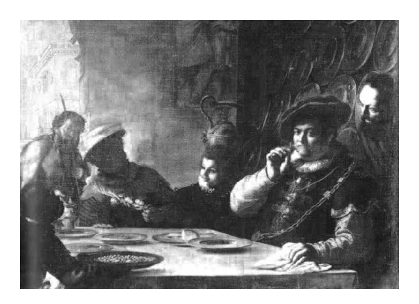
Figure 5. Preti in Rome - The Parable of the rich man and Lazarus - 1653.

Council. According to the archival records<sup>1</sup> he had wanted to enlarge by transforming into a square shape - the oval vault windows but this proposal had been refused in view of the insistence of third parties that cracks would consequently appear in the vault. Mattia had also wanted to eliminate the cross walls that separated the different langue chapels but, because of fears of inadequate support for the immense vault, this was scaled down to a mere widening of the arched doorways to a bare minimum of "tre palmi per parte". He had also wanted, and this time obtained approval, for introducing the heavy piers - which he later brilliantly decorated with carved and gilded decoration - supporting the arches to the side chapels. But, perhaps, the main architectural achievement of Mattia Preti in the Conventual church - for which he understandably obtained immediate approval - concerned the entrance wall of the building where, on the inside, a magnificent balustrade and a larger door 'window of appearances' – to be used after the election of a new Grand Master - was formed while on the outside, the bland