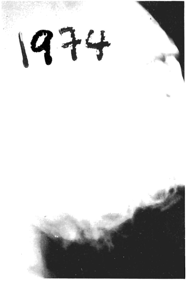
Fig.5 - Case B: fibrous dysplasia of the mandible and supernumery teeth.

The dental surgeon<sup>11</sup> who first treated these two siblings for mandibular osteomata and supernumerary teeth had rightly suspected Gardner's syndrome as the underlying cause of these oral problems. It was, however, years later that the two girls presented with symptoms related to polyposis coli and abdominal desmoids and the serious implications of the underlying conditions were recognised. Surely a Familial Polyposis