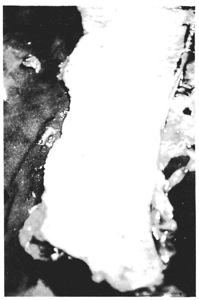
Fig.4 - Case A: multiple polyps in subtotal colectomy specimen.

There was a desmoid tumour arising from the previous laparotomy scar infiltrating all the layers of the abdominal wall. There were a large right and a small left ovarian endometriotic (chocolate) cysts.