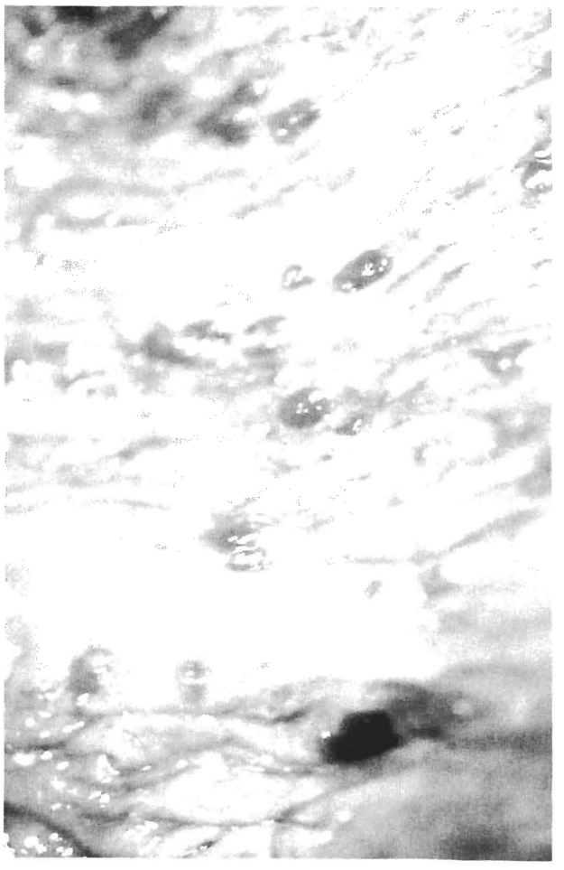
Fig.1 - Case A: multiple polyps in colectomy specimen.

A 25 year old woman presented in June 1995 with two episodes of rectal bleeding and suprapubic pain. On examination she had an indurated hypertrophic lower abdominal scar resulting from a laparotomy for colonic perforation due to an ingested needle nine years previously. There was also a pelvic mass which was shown to be a large multilocular ovarian cyst on ultrasound examination. She also had multiple fibromata