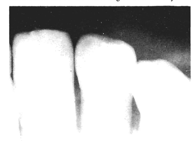
Fig.3 - Case A: supernumery teeth.

the age of 12 years, and excision of osteomata of the mandible at 17 years. At the time she was also noted to have other dental abnormalities including supernumerary teeth (Figure 3). A 2.5cm lump arising from the rectus sheet had been excised in 1992. Histology showed well-organised fibrous tissue. She was considered to be at high risk of developing colonic carcinoma and was advised to undergo laparotomy for colonic ablation and excision of the large ovarian cyst. Findings at laparotomy included dense adhesions matting the whole of the small intestine into a solid mass with fibrosis/calcification and severe shortening of the mesentery.